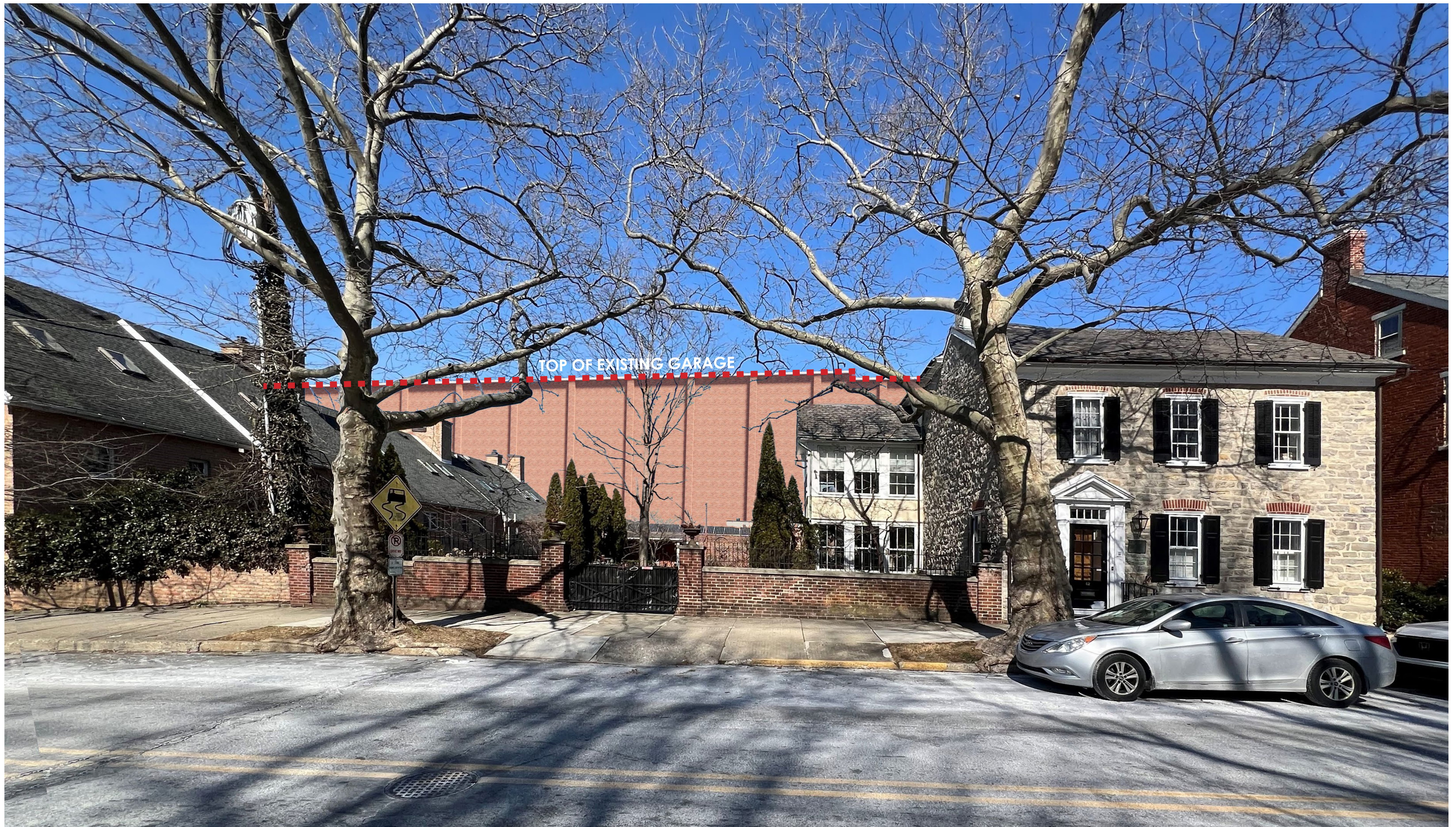
EXISTING VIEW LOOKING NORTH FROM W MARKET STREET - WINTER CONDITION