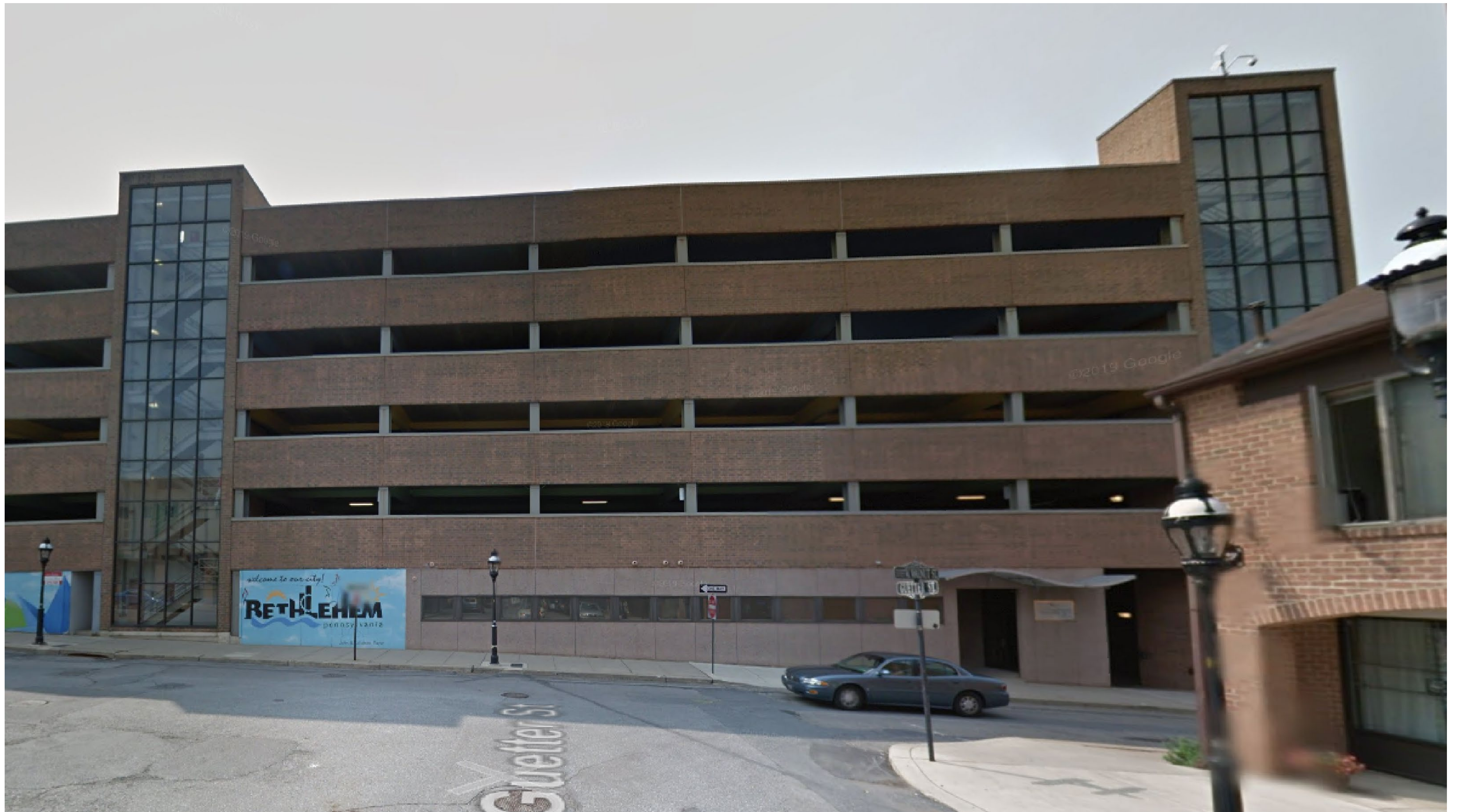
VIEW LOOKING SOUTH FROM GUETTER STREET AND W WALNUT STREET