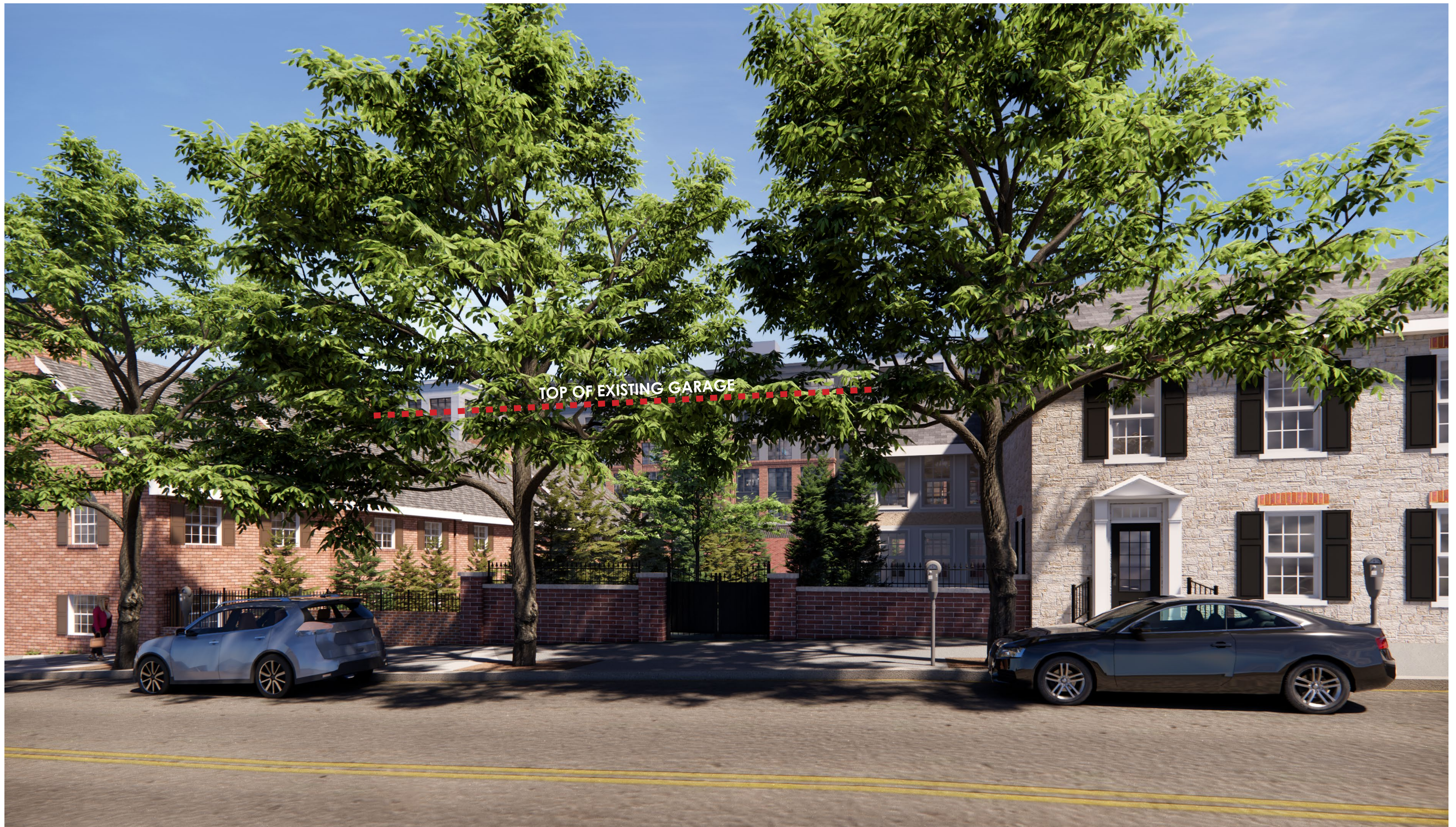
PROPOSED VIEW LOOKING NORTH FROM W MARKET STREET - SPRING CONDITION