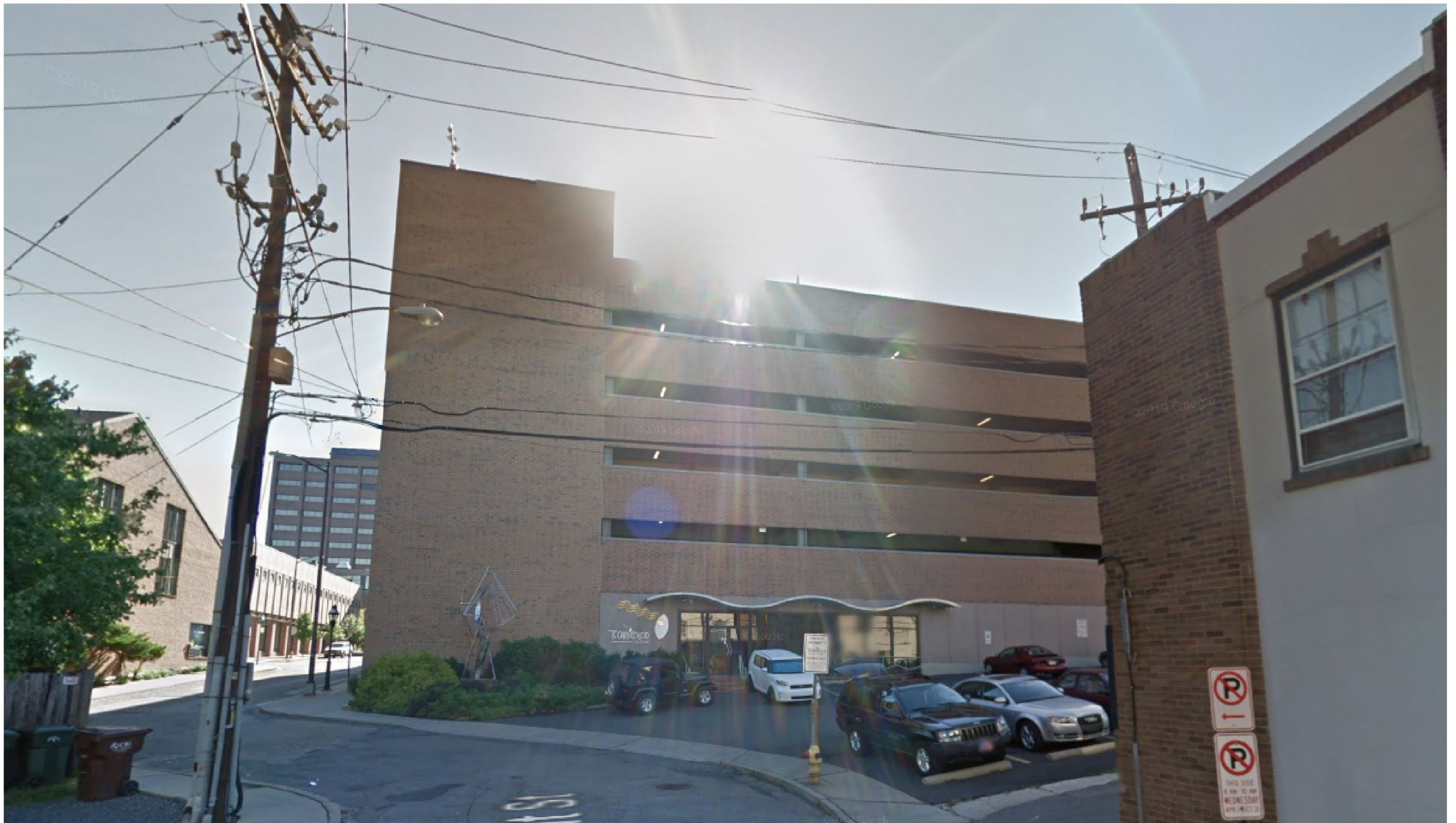
VIEW LOOKING EAST FROM W WALNUT STREET