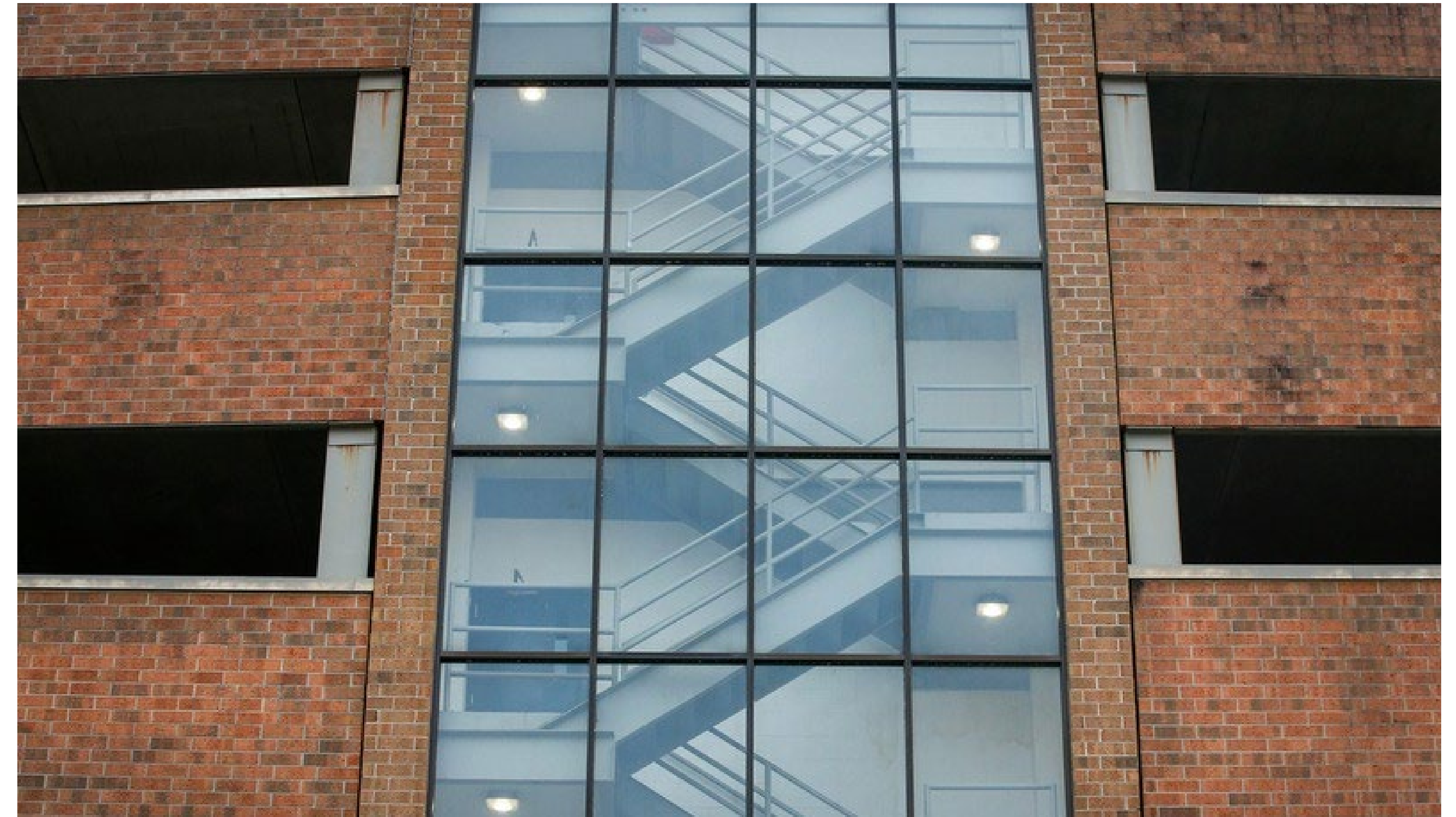
VIEW LOOKING SOUTH - ELEVATION DETAIL