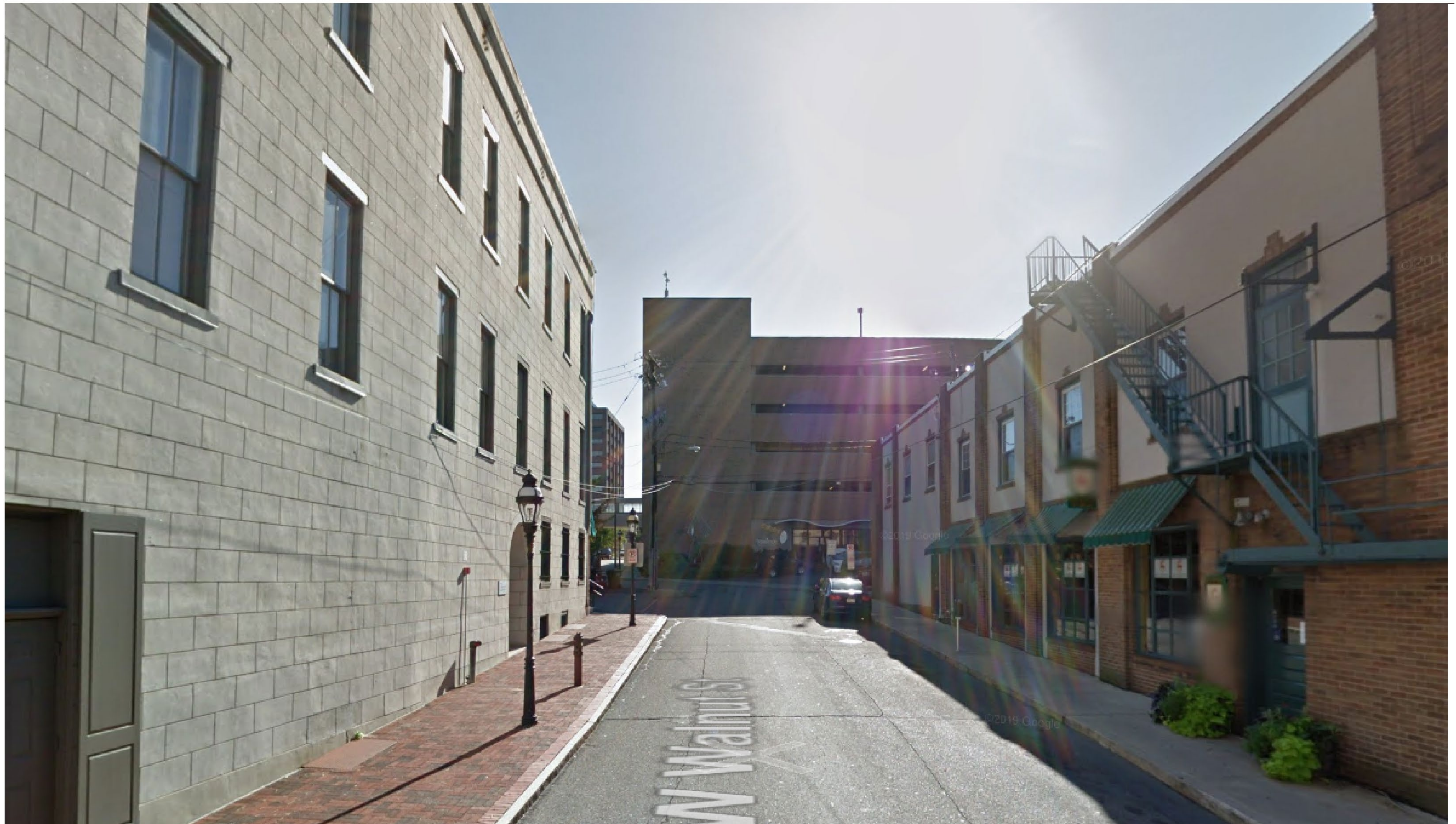
VIEW LOOKING EAST FROM W WALNUT STREET