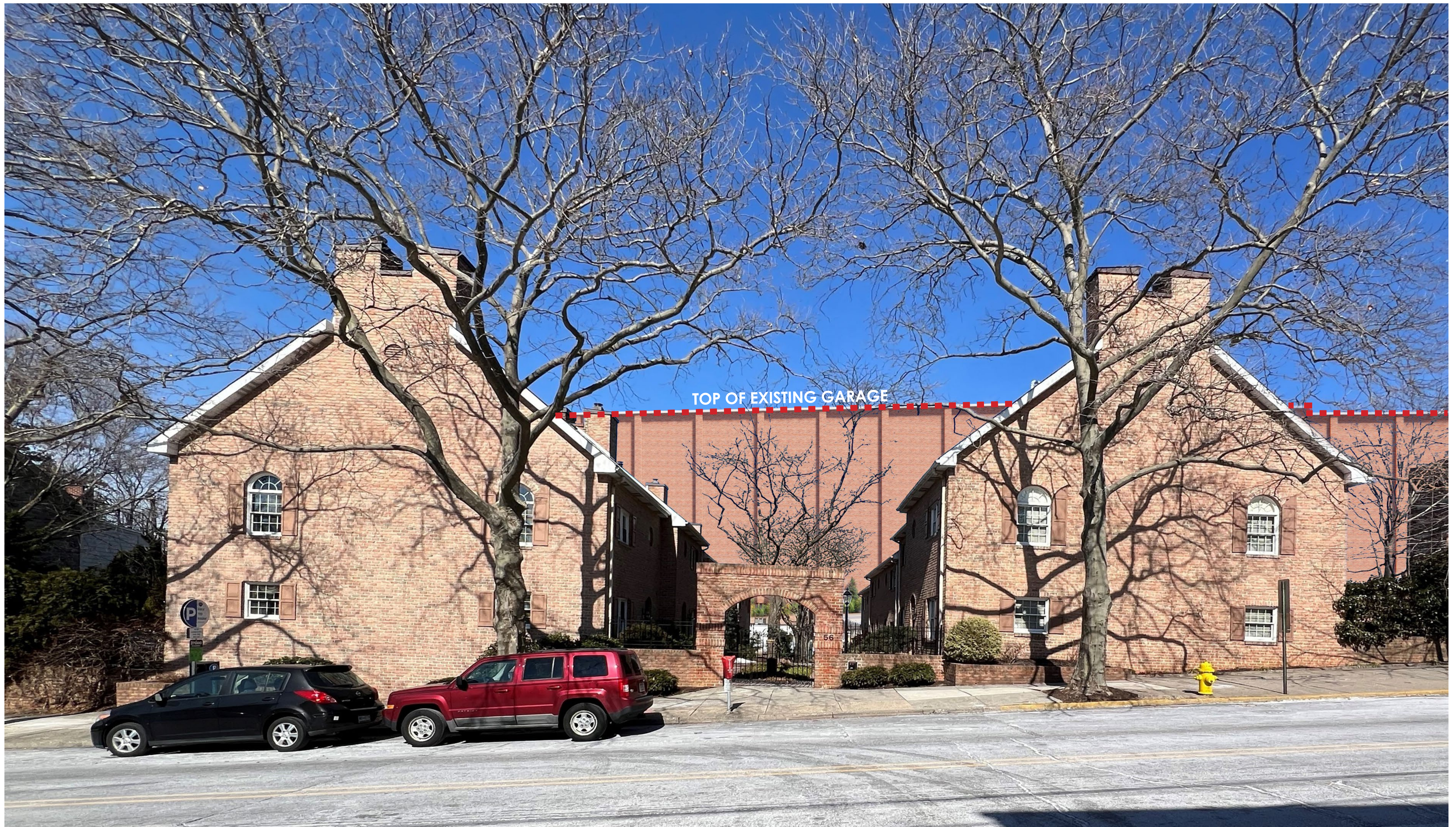
EXISTING VIEW LOOKING NORTH FROM W MARKET STREET - WINTER CONDITION