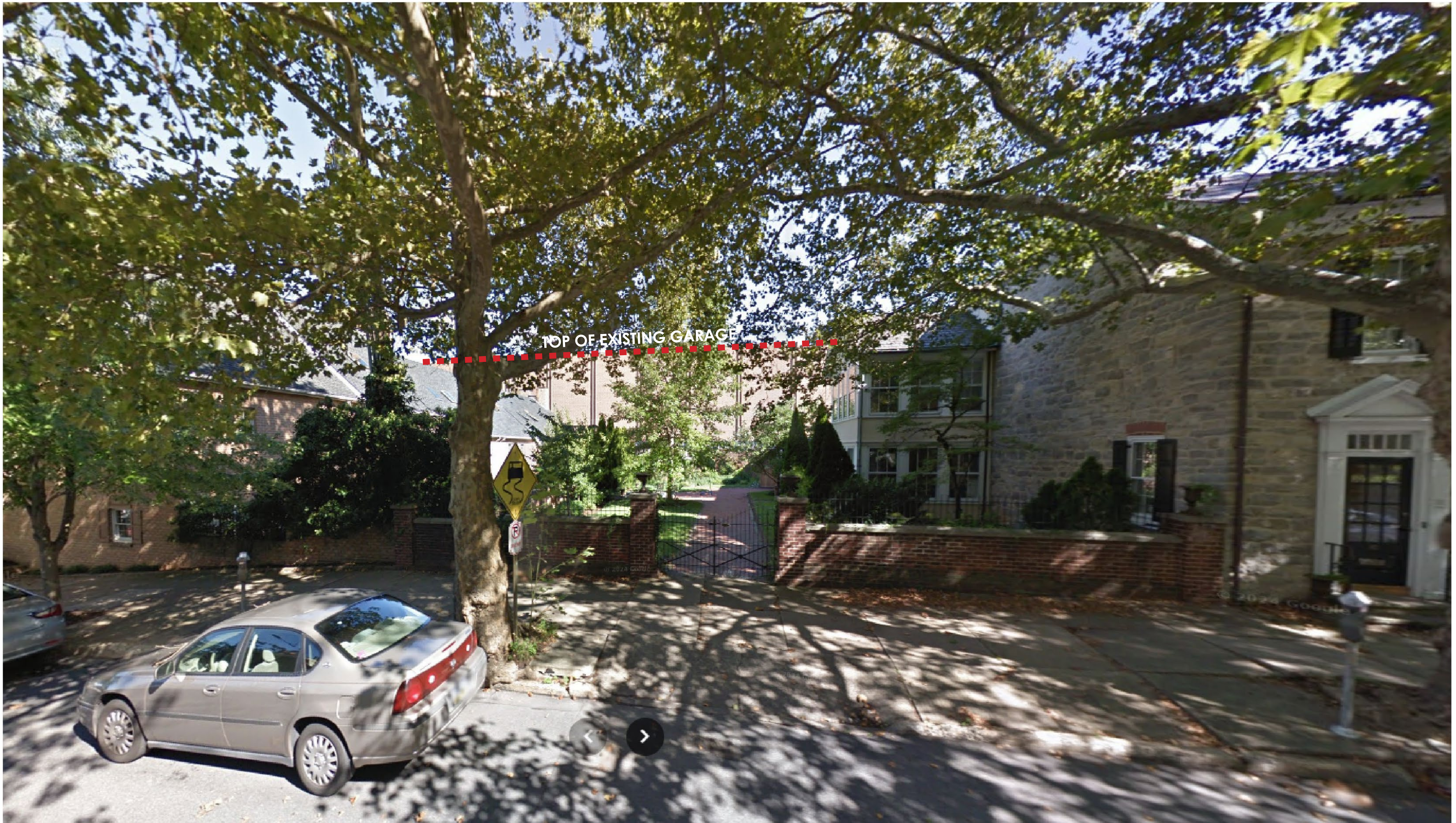
EXISTING VIEW LOOKING NORTH FROM W MARKET STREET - SPRING CONDITION