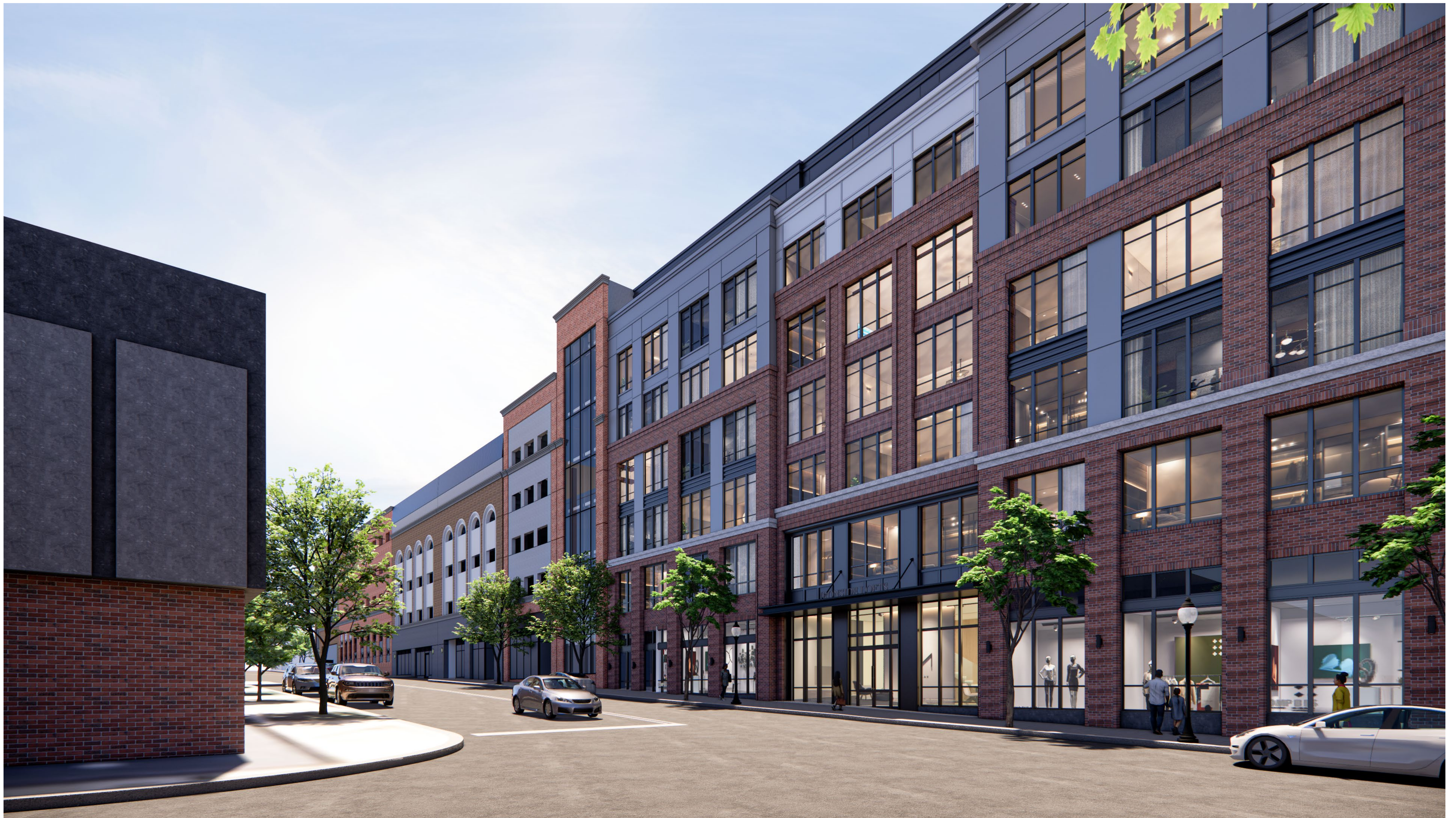
VIEW LOOKING SOUTH FROM GUETTER STREET AND W WALNUT STREET