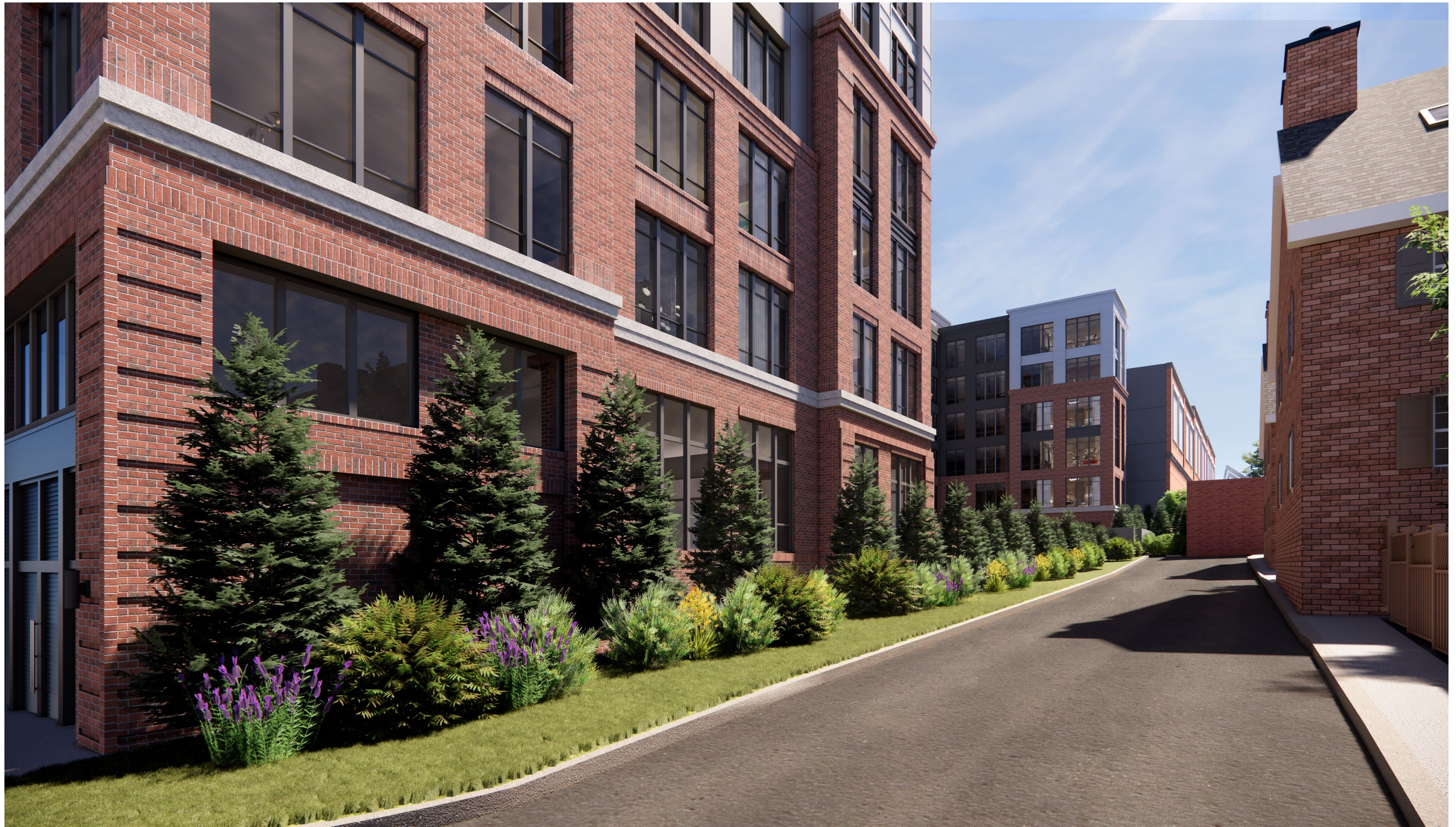
VIEW LOOKING EAST AT REAR LOT ACCESS DRIVE