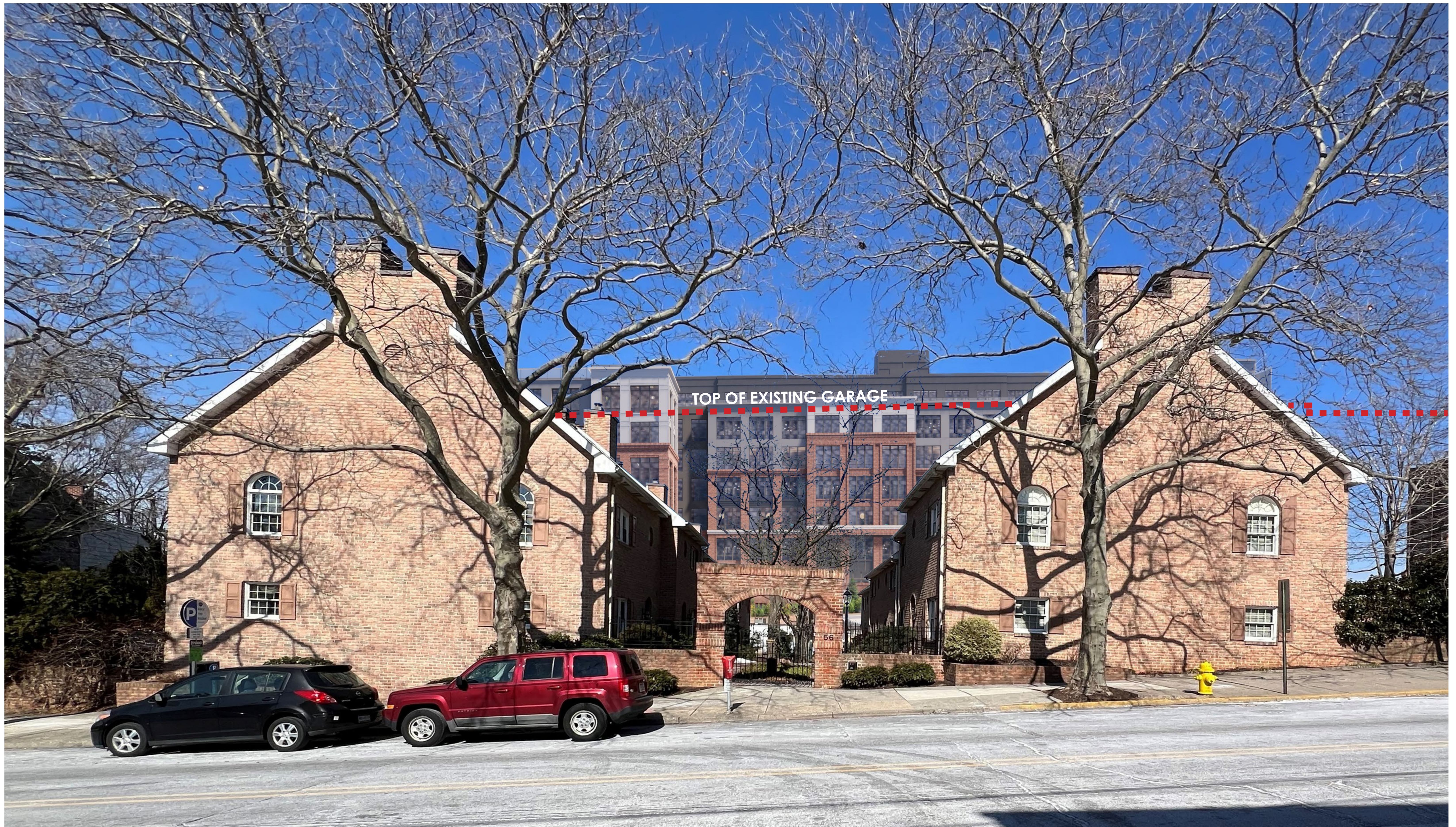
PROPOSED VIEW LOOKING NORTH FROM W MARKET STREET - WINTER CONDITION