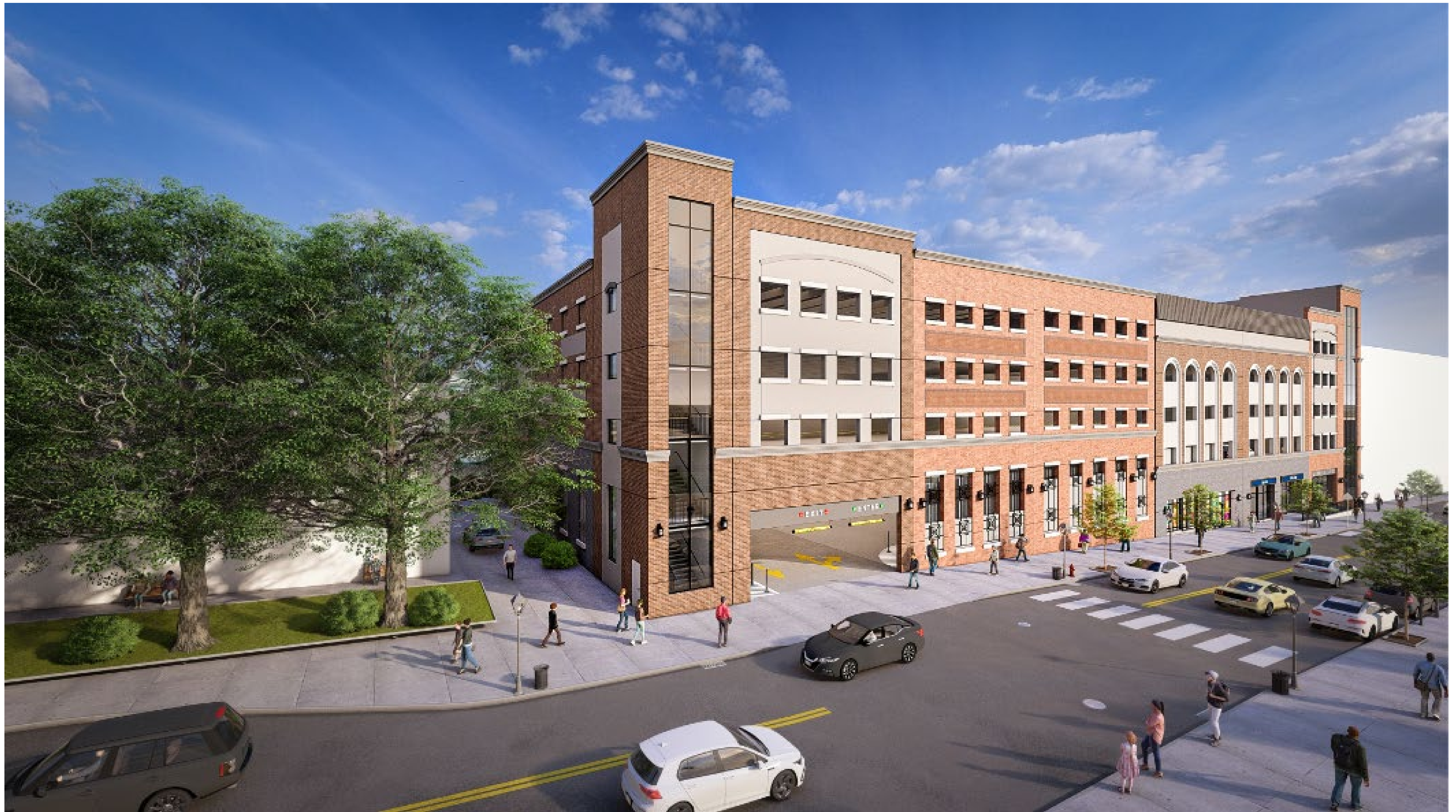
VIEW LOOKING SOUTH EAST FROM W. WALNUT STREET - NEW PUBLIC PARKING GARAGE