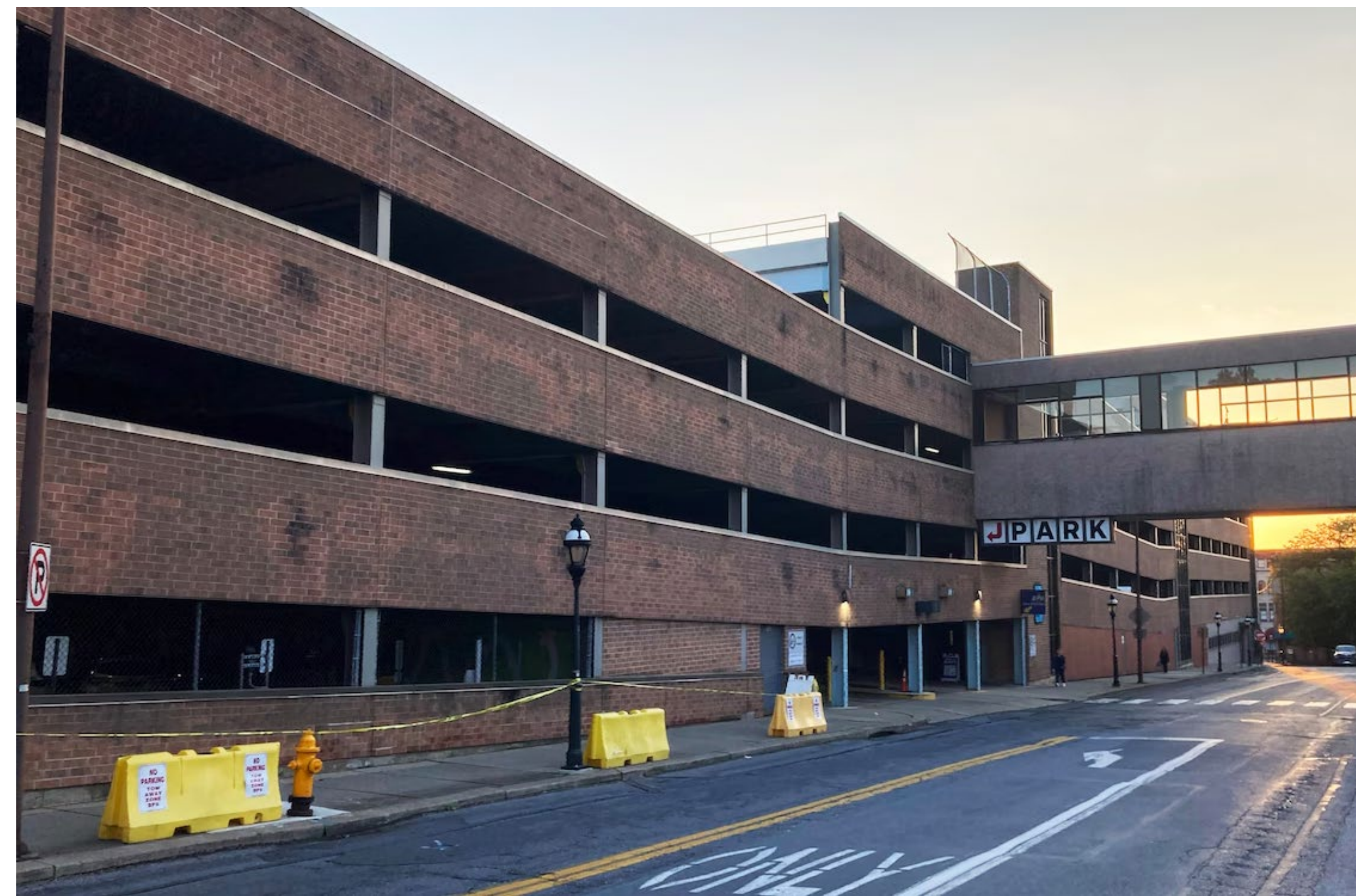
VIEW LOOKING EAST FROM W. WALNUT STREET