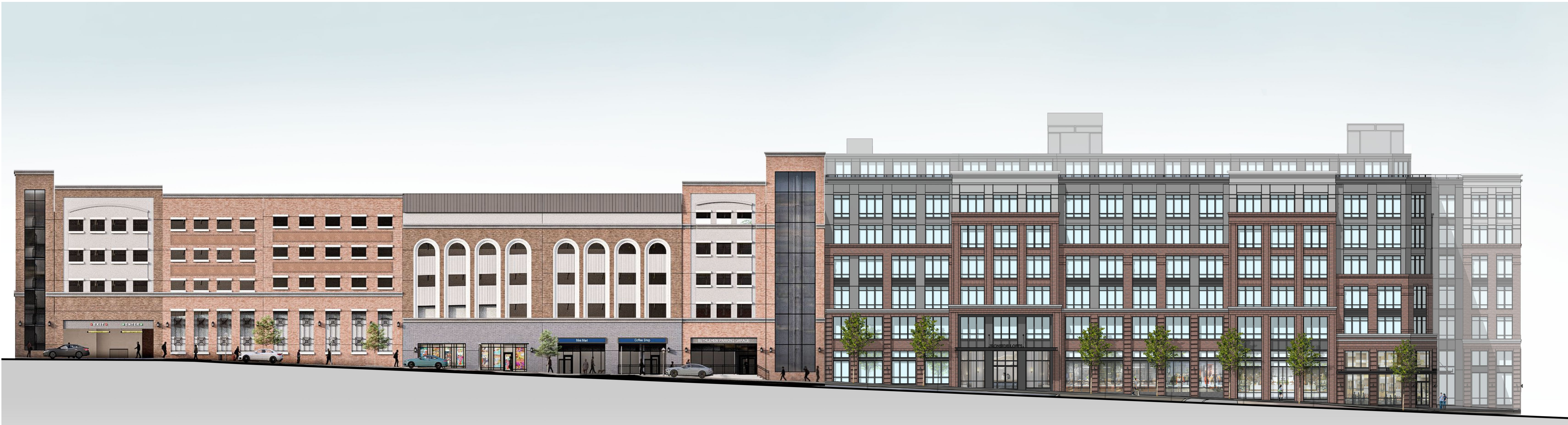
NORTH ELEVATION - W WALNUT STREET