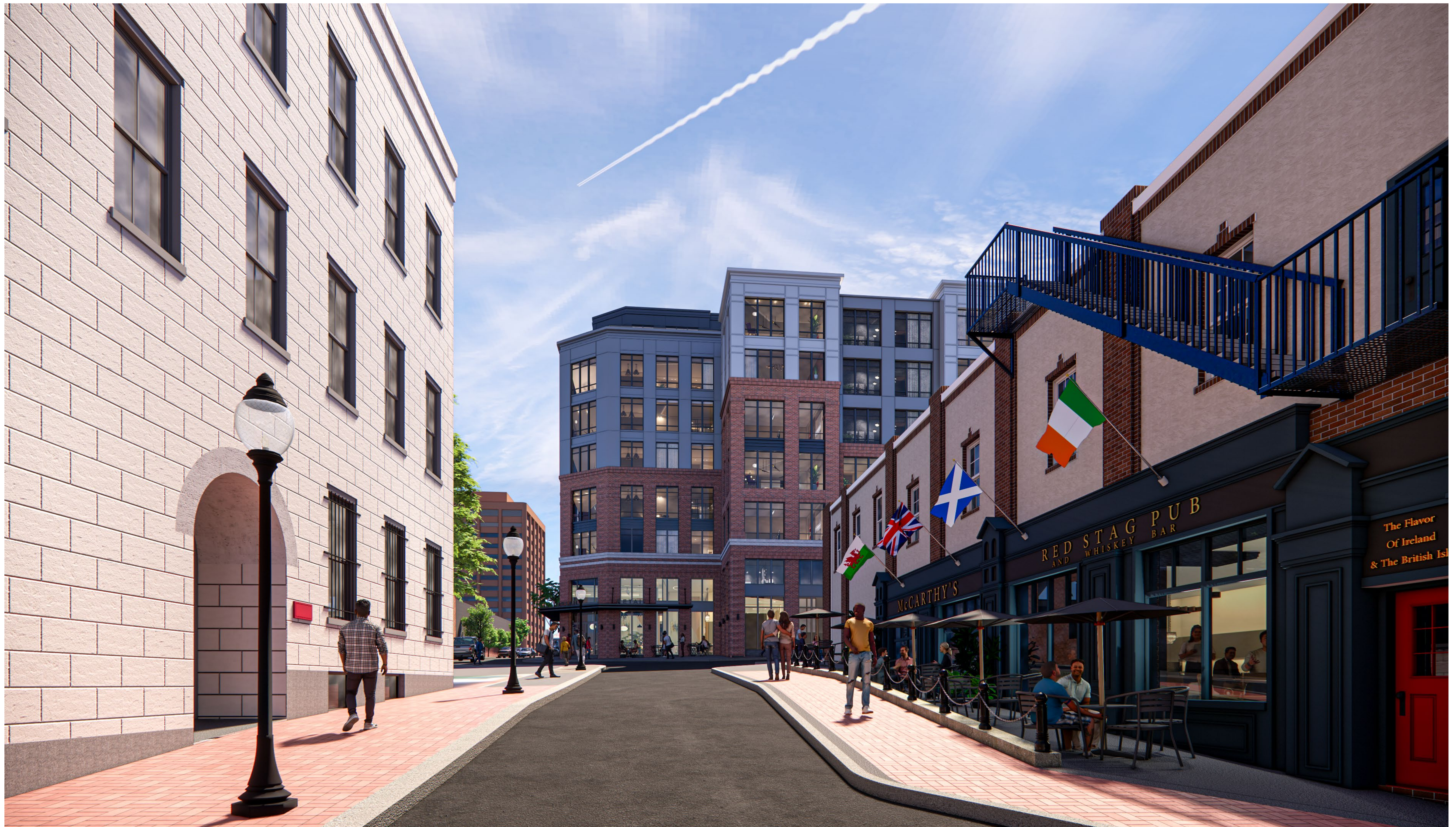
VIEW LOOKING EAST FROM W WALNUT STREET