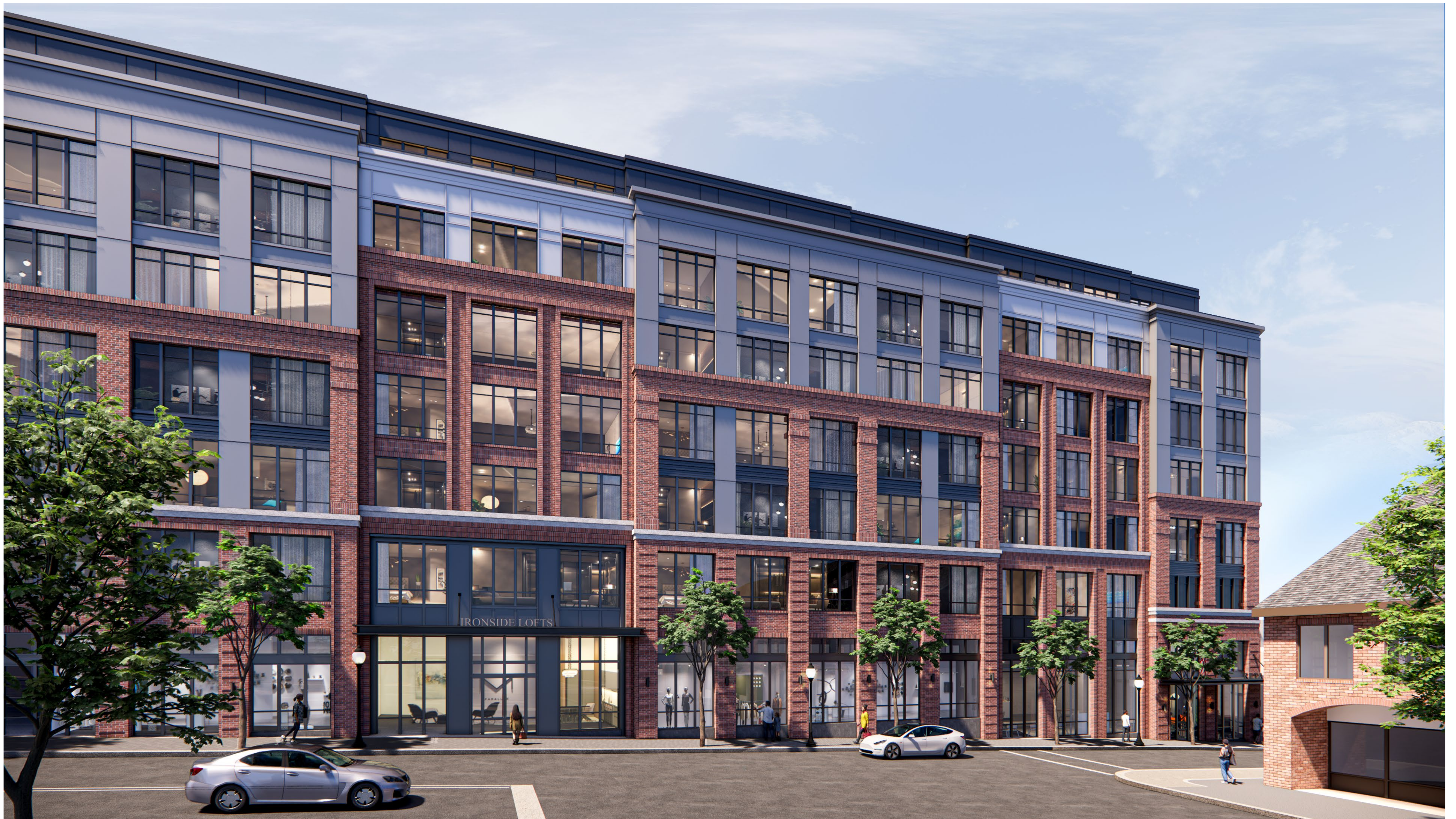
VIEW LOOKING SOUTH FROM GUETTER STREET AND W WALNUT STREET