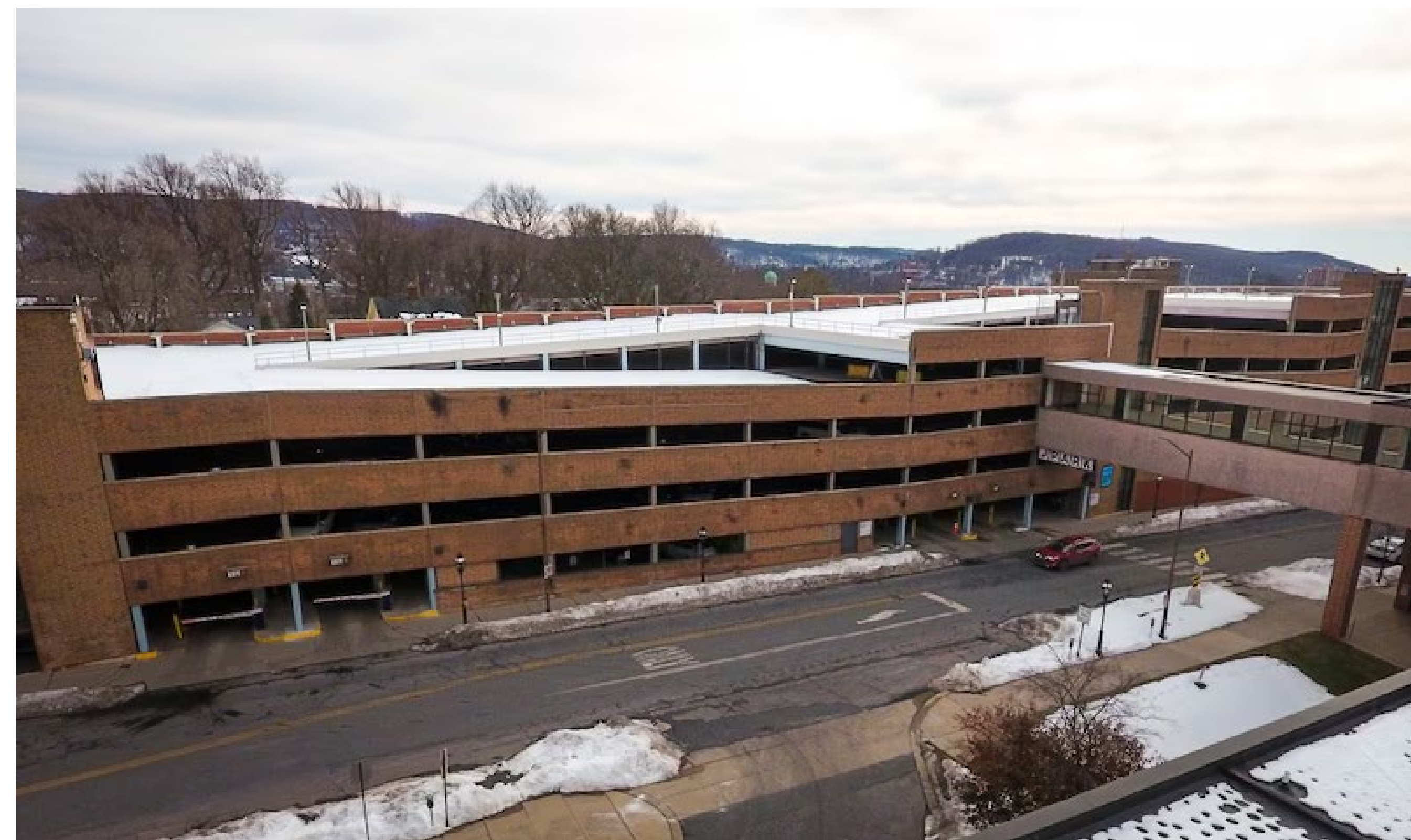
VIEW LOOKING SOUTH FROM W. WALNUT STREET