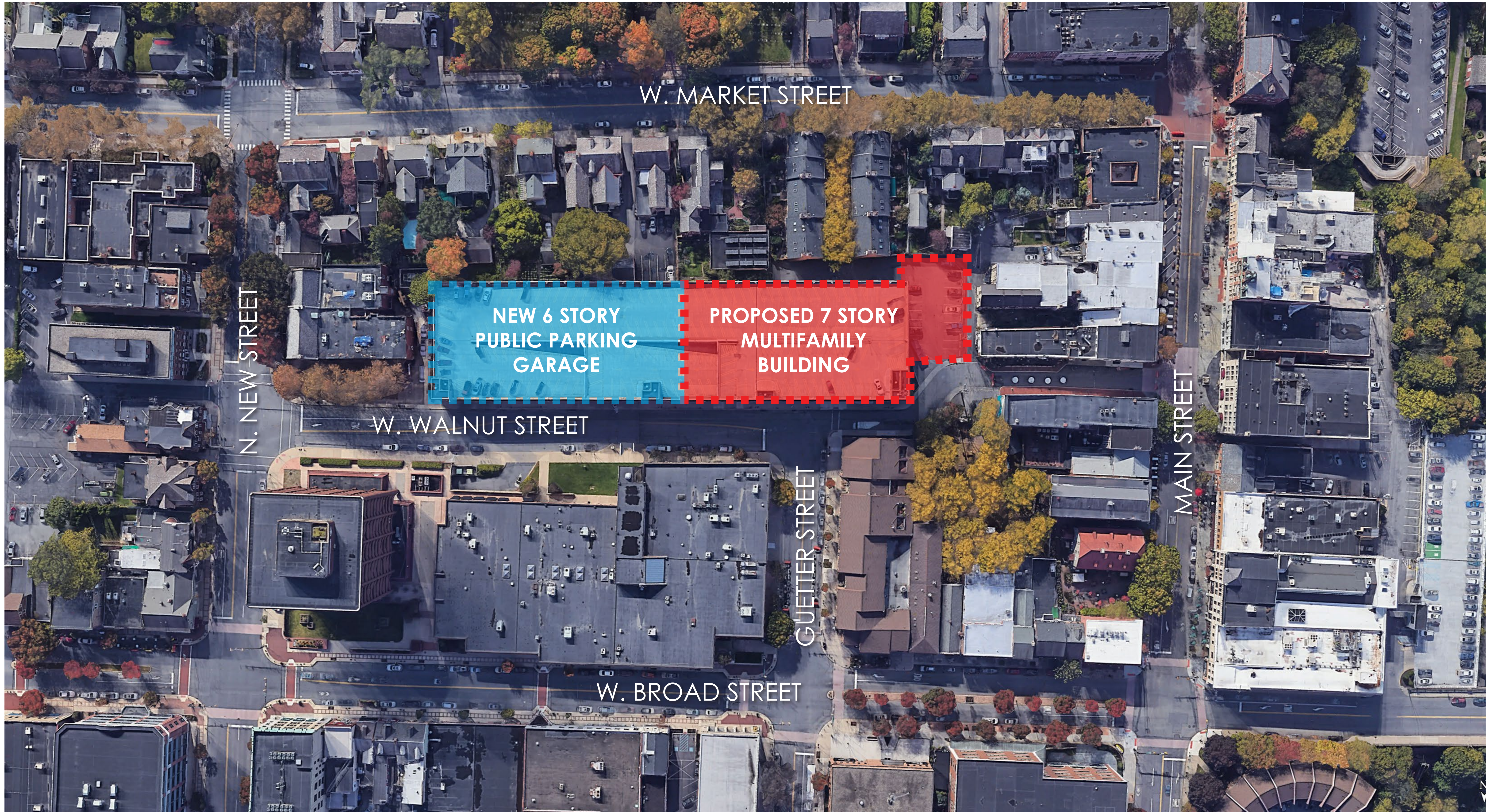
SITE PLAN - EXISTING