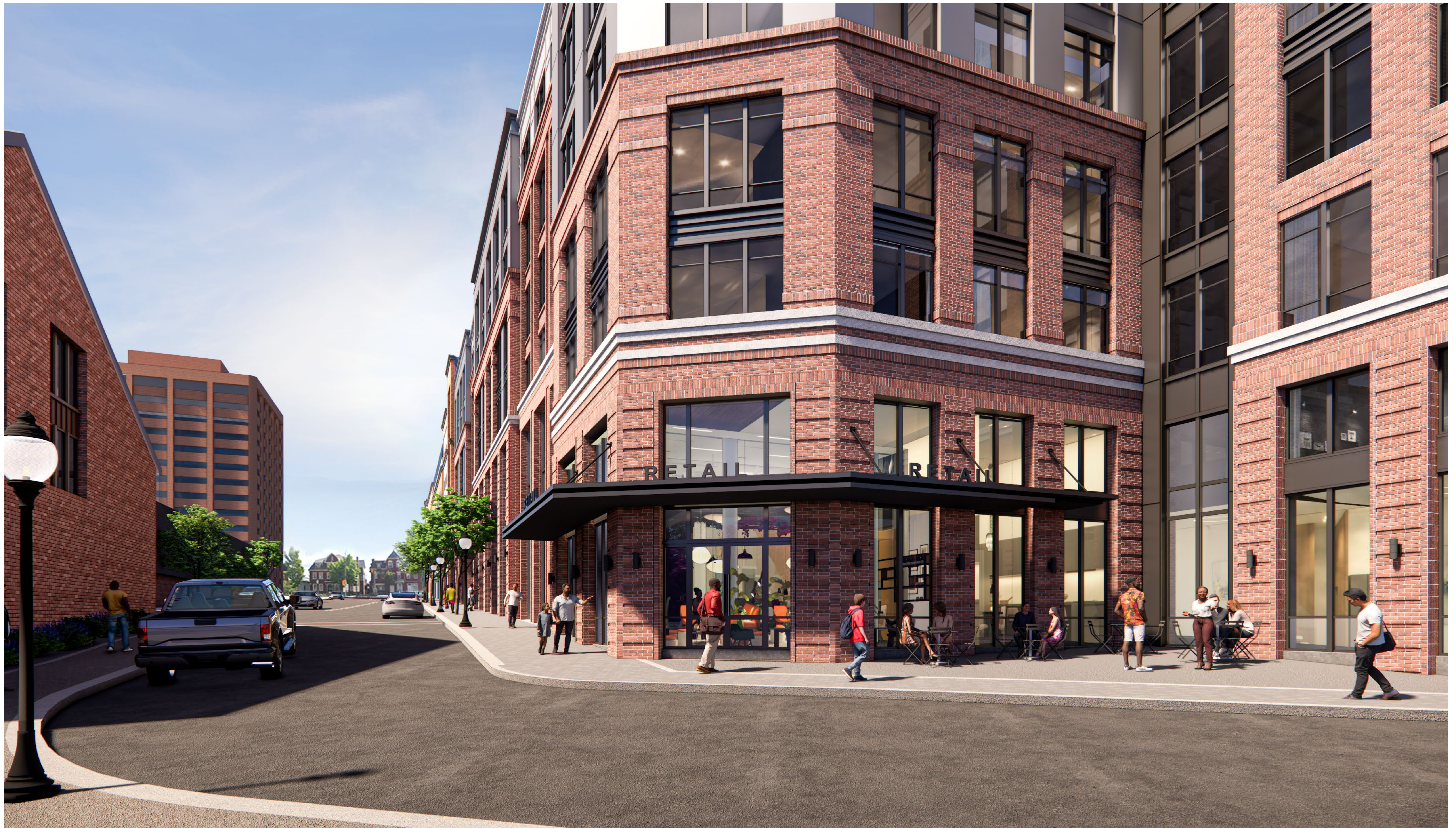
VIEW LOOKING EAST FROM W WALNUT STREET