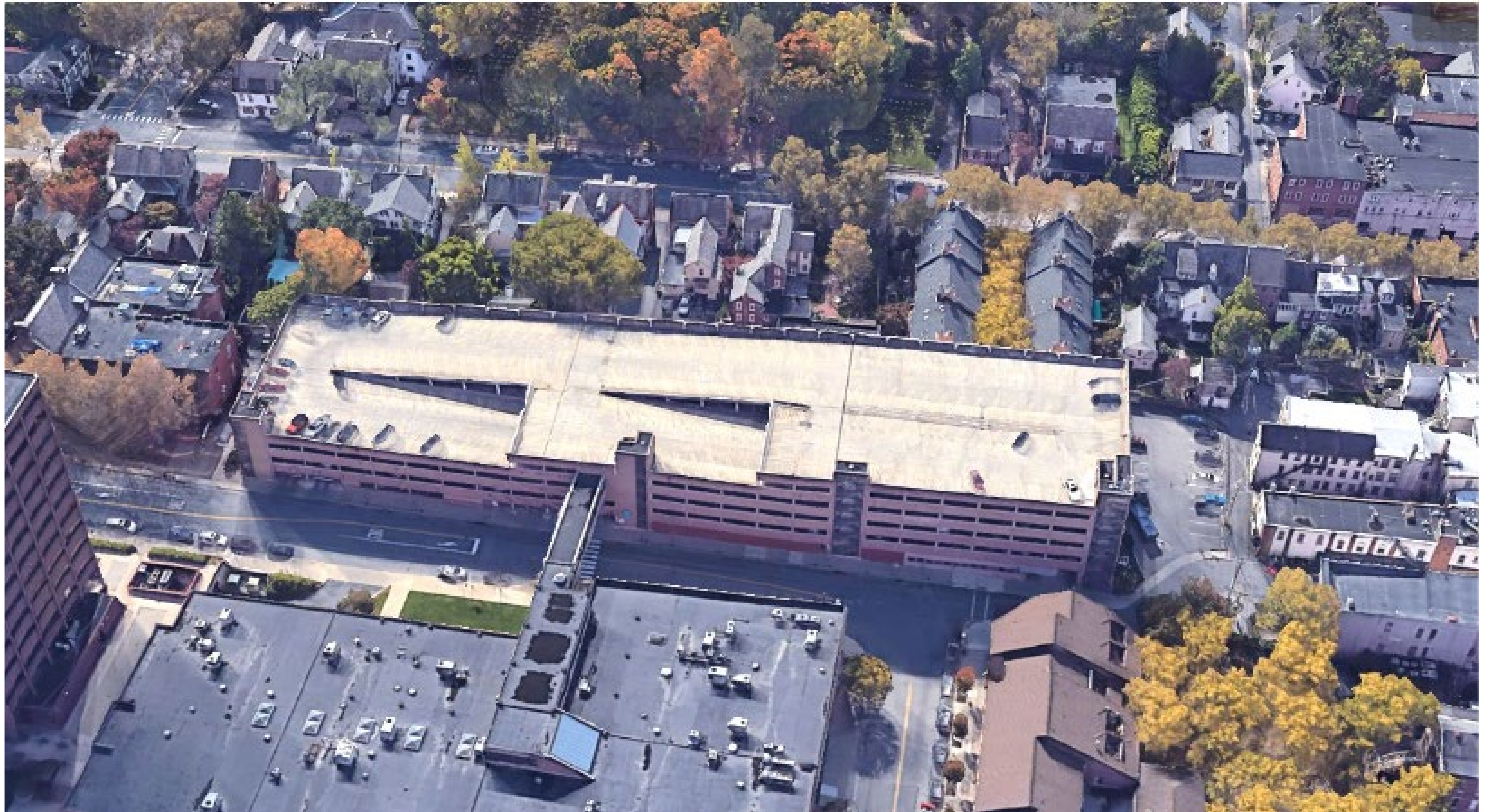
VIEW OF WALNUT STREET LOOKING SOUTH