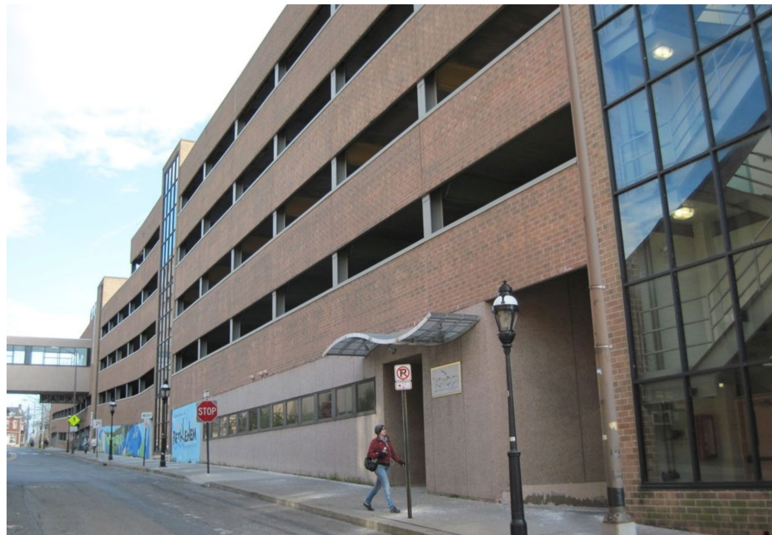
VIEW LOOKING WEST FROM W. WALNUT STREET