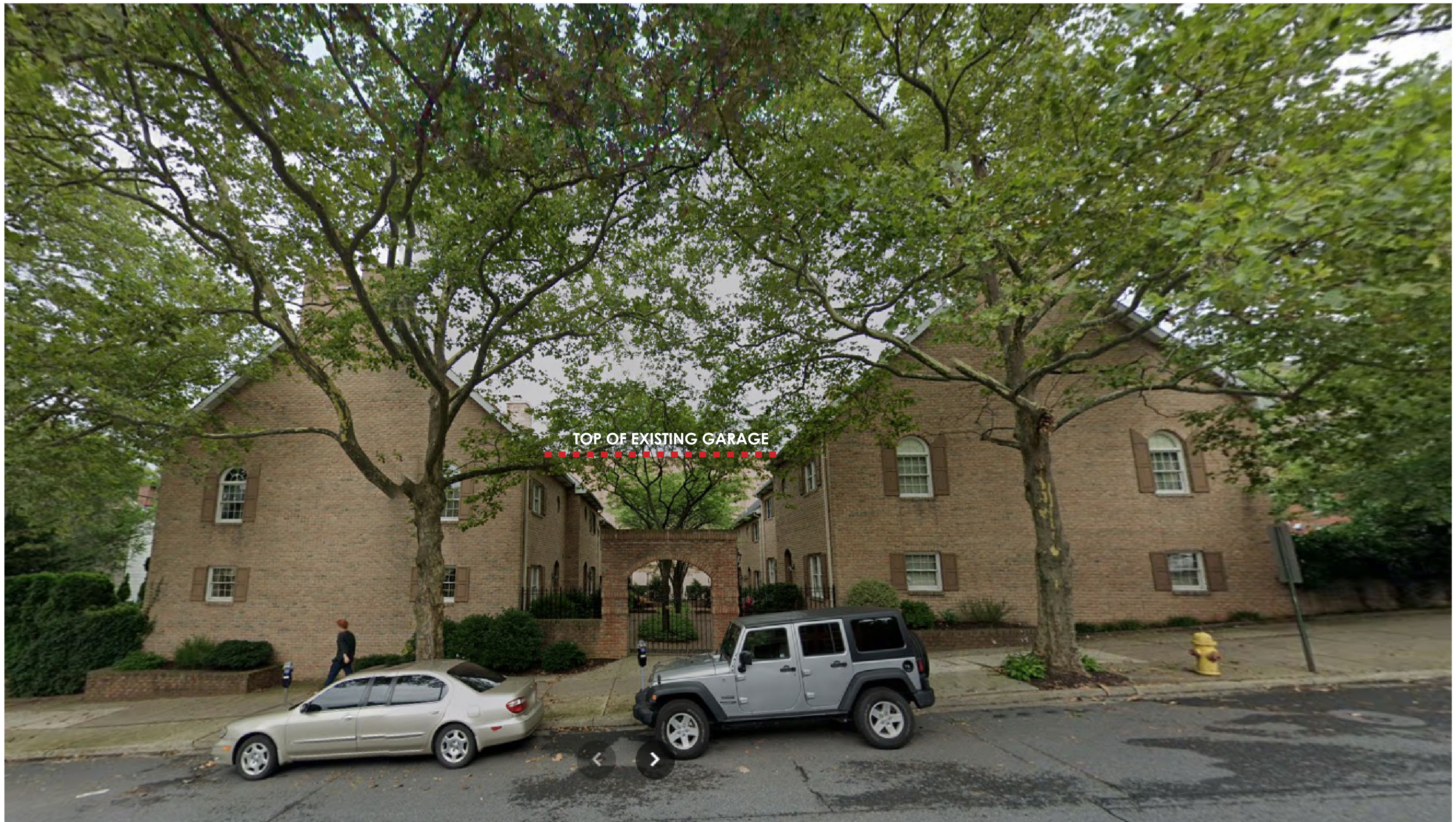
EXISTING VIEW LOOKING NORTH FROM W MARKET STREET - SPRING CONDITION