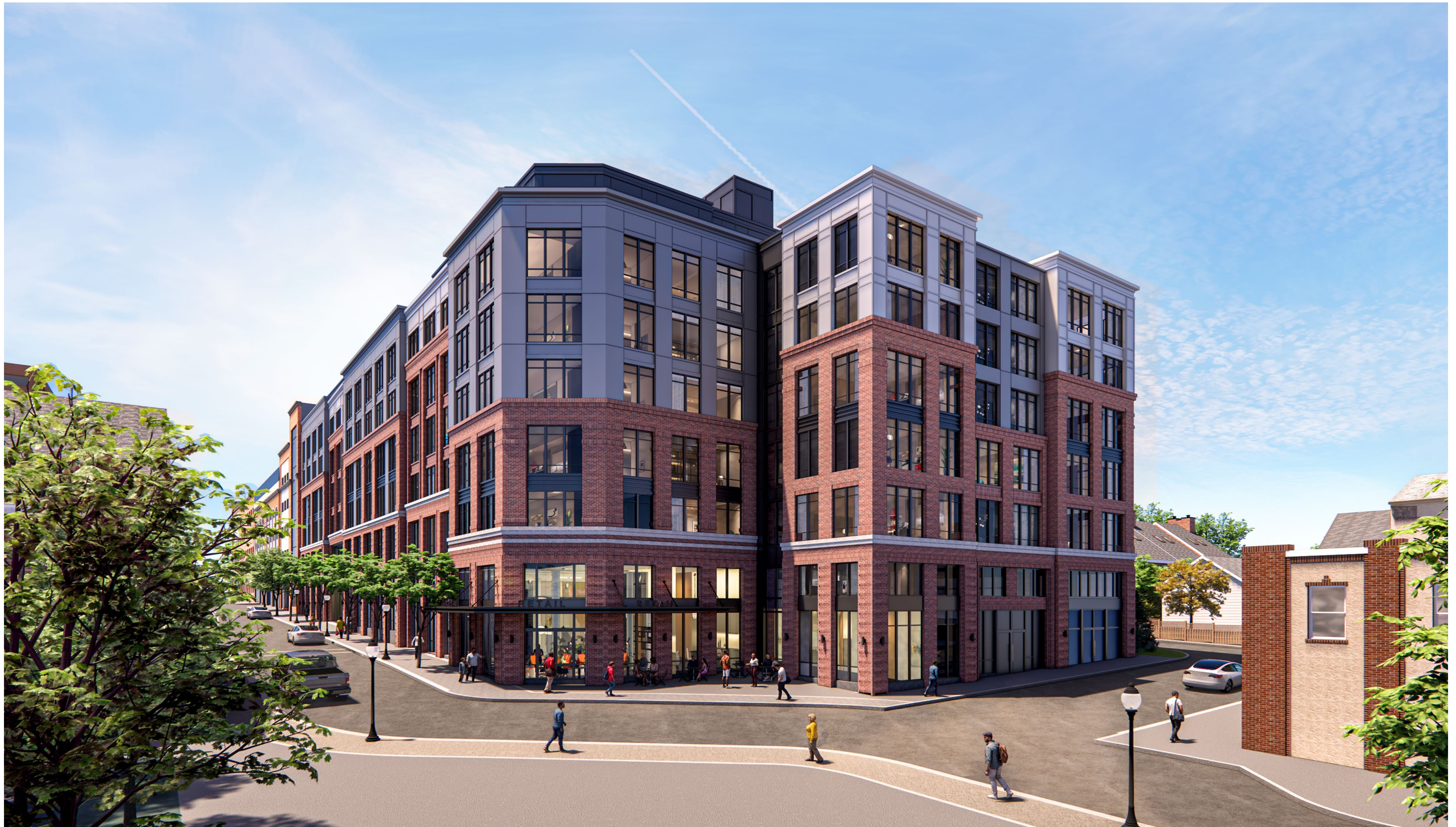
VIEW LOOKING EAST FROM W WALNUT STREET