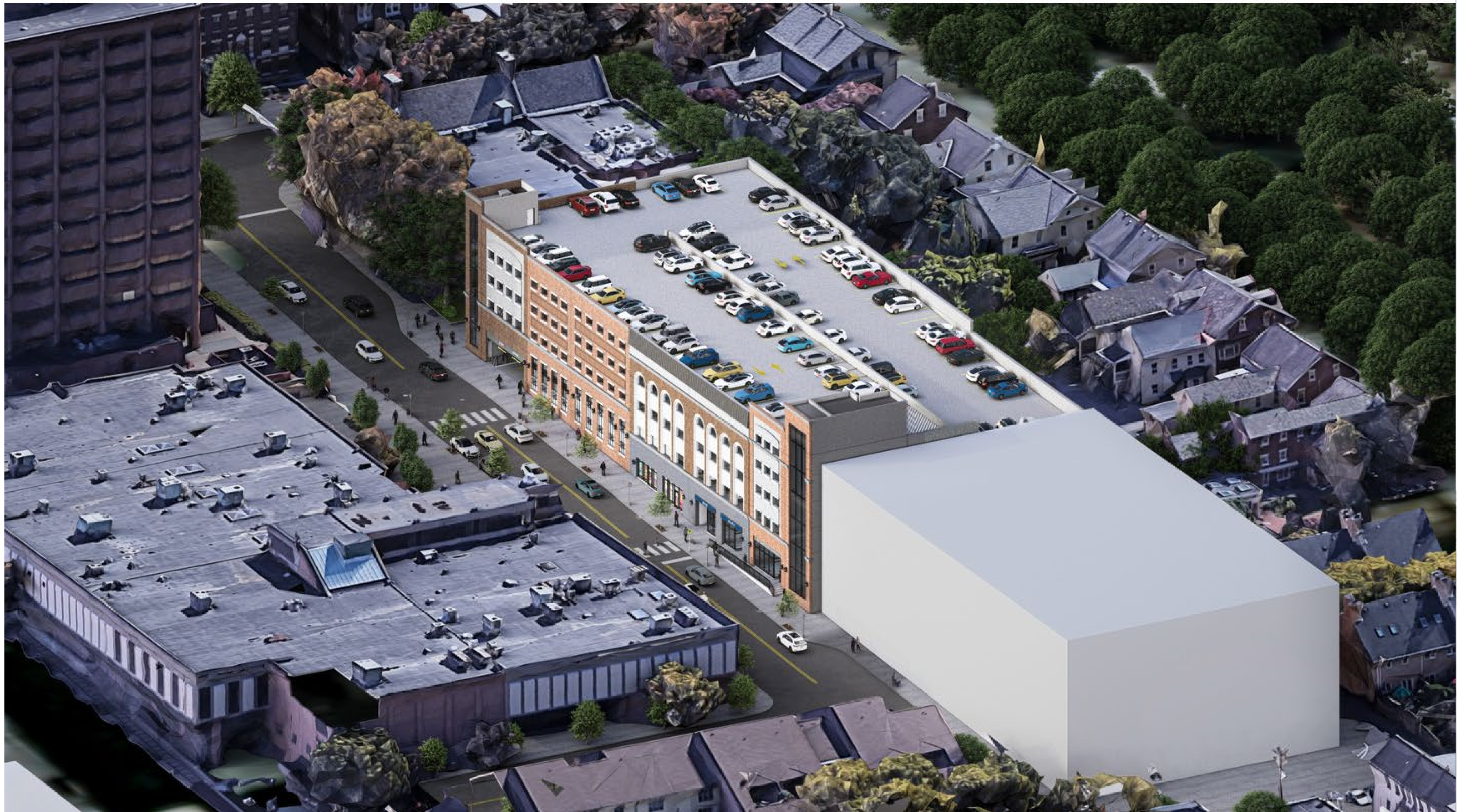
VIEW LOOKING SOUTH WEST FROM MAIN STREET - NEW PUBLIC PARKING GARAGE