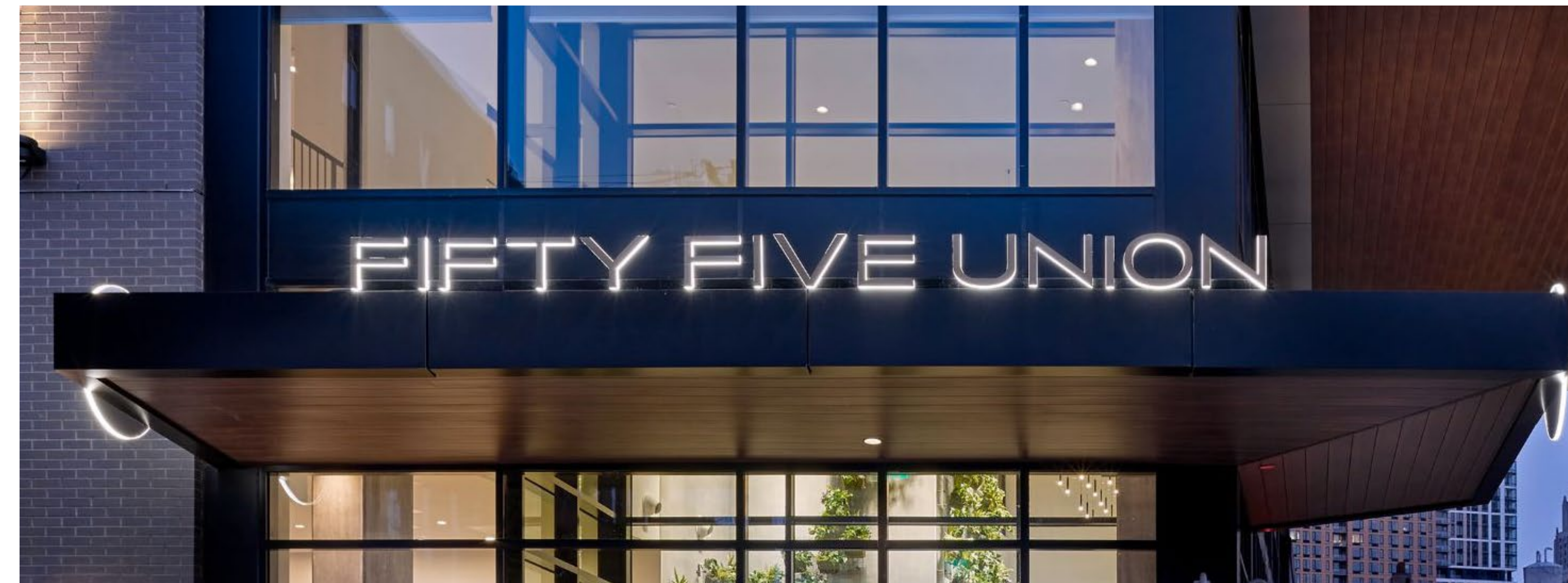
04 SIGNAGE EXAMPLE - DESIGN PRECEDENT IMAGERY