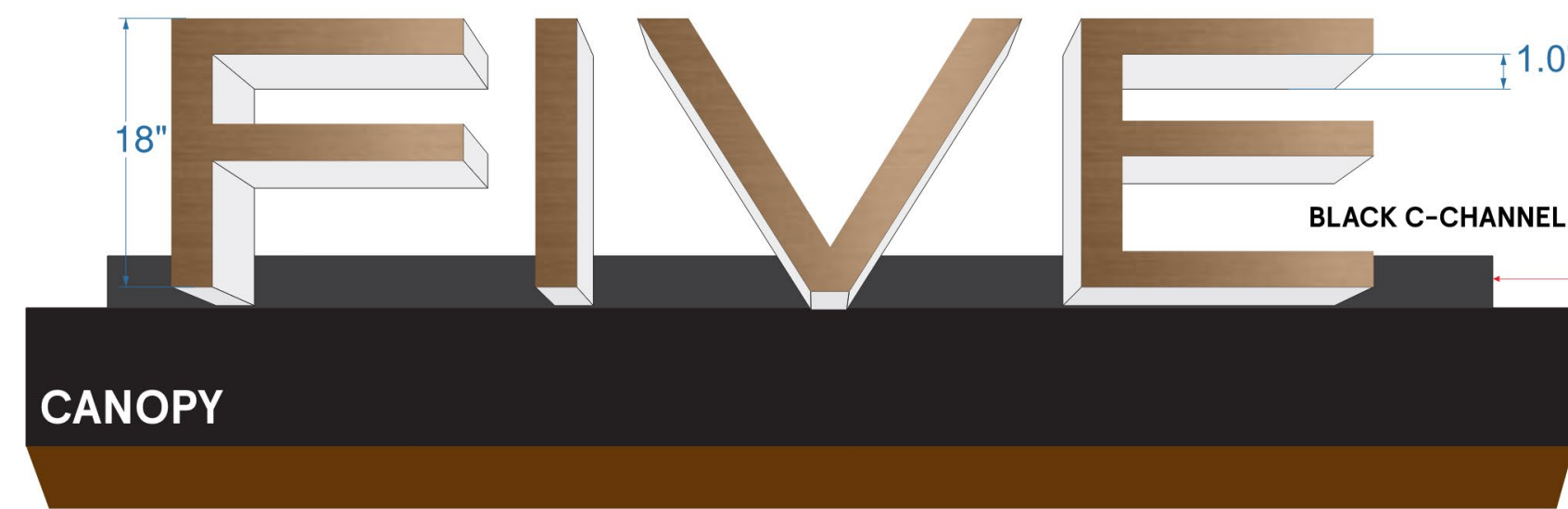
03 SIGNAGE DETAIL

CANOPY SIGN - RETAIL ENTRANCE (NORTH & WEST ELEVATIONS) - INDIVIDUAL CHANNEL CUT, STAINLESS STEEL & LIGHT BRONZE FINISH LETTERS MOUNTED AT THE EDGE OF ARCHITECTURAL METAL CANOPY -LED SIDELIT LETTERS - 1" TRANSLUCENT WHITE ACRYLIC -SIGN DIMENSION 18" TALL X LENGTH VARIES