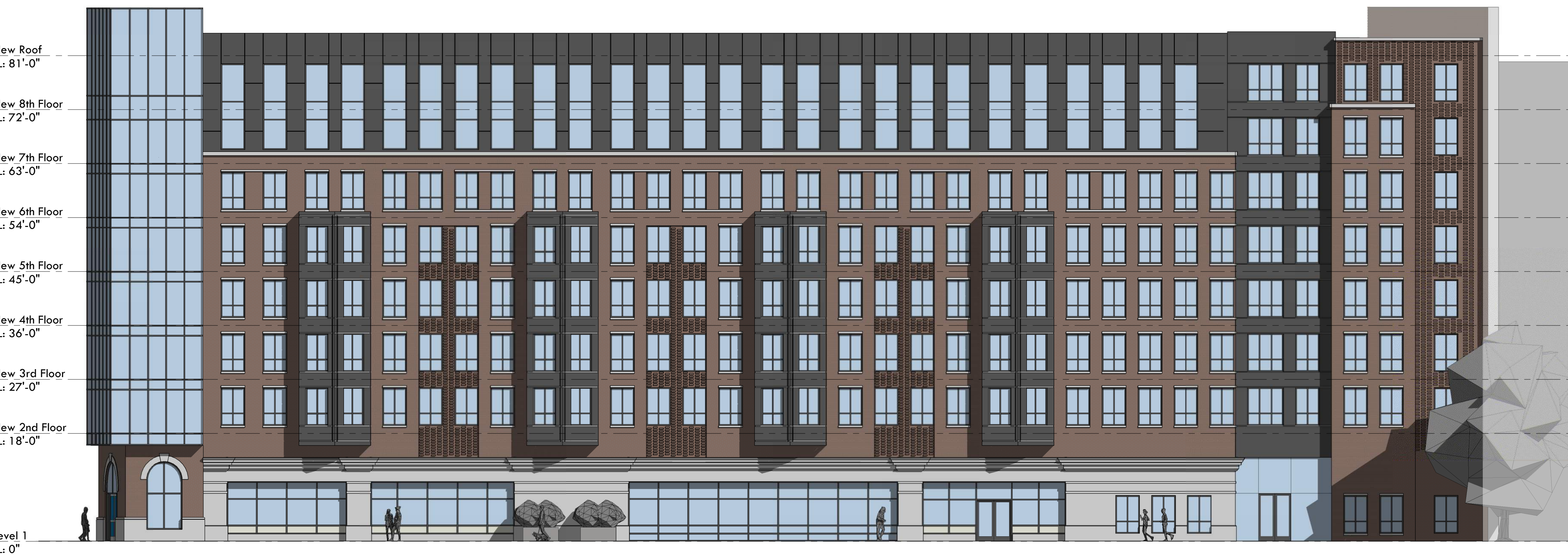
2 Building Elevation - Greenway SCALE: 3/32" = 1'-0"