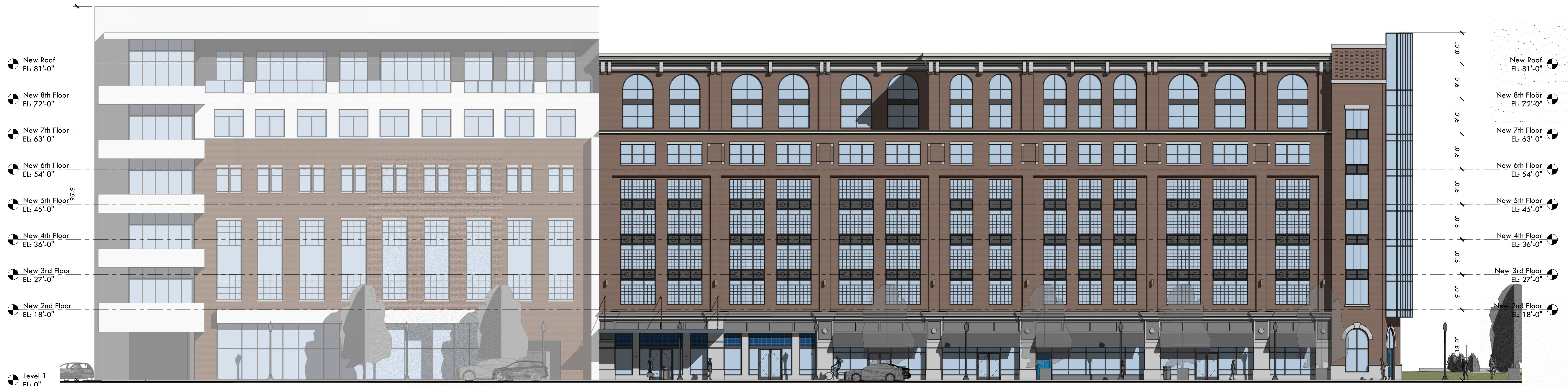
1 Building Elevation - 3rd Street SCALE: 3/32" = 1'-0"