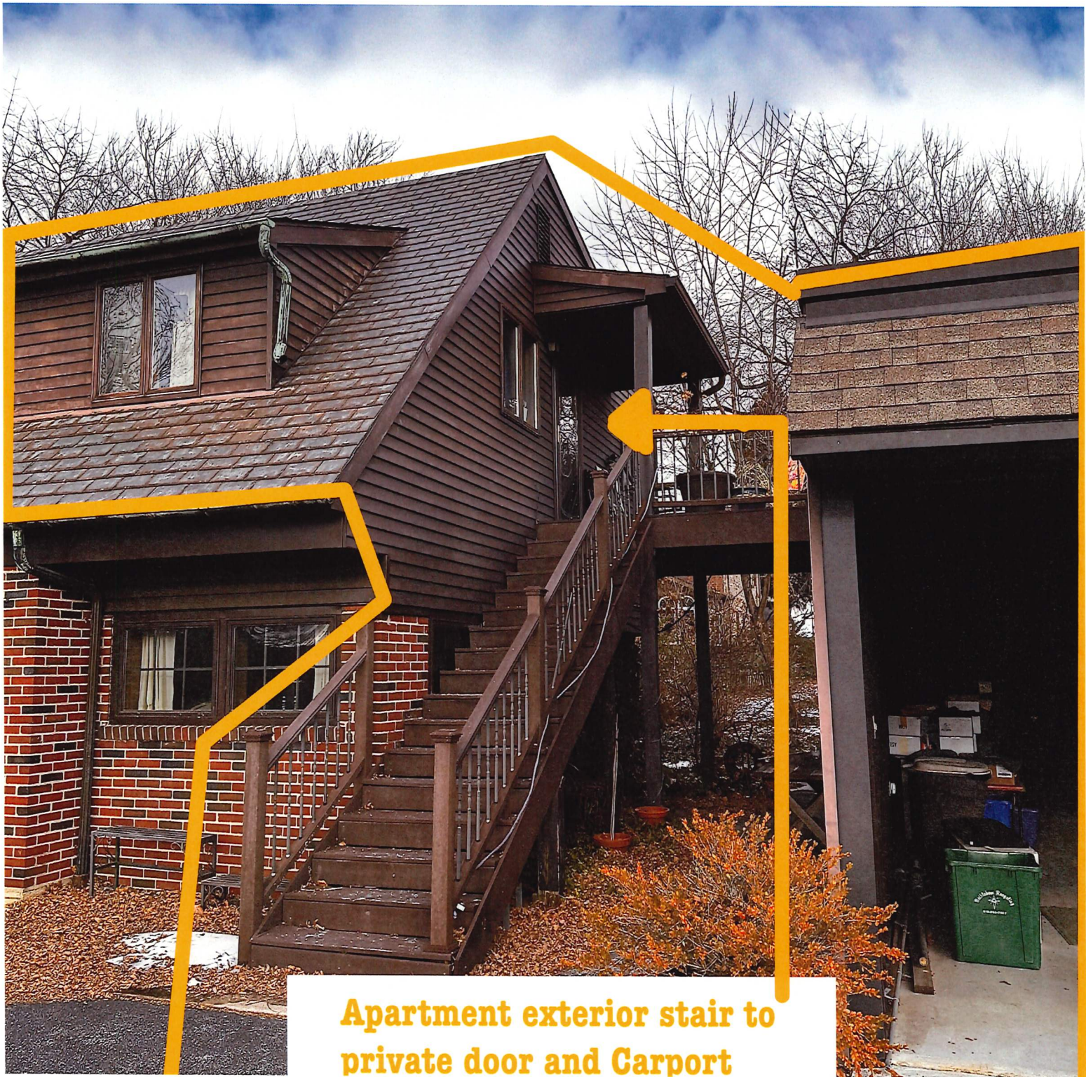
Apartment exterior stair to private door and Carport