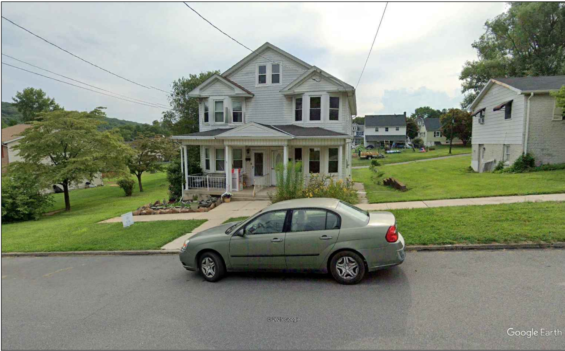
247-253 8th AVENUE (TWO SINGLE FAMILY SEMI-DETACHED)