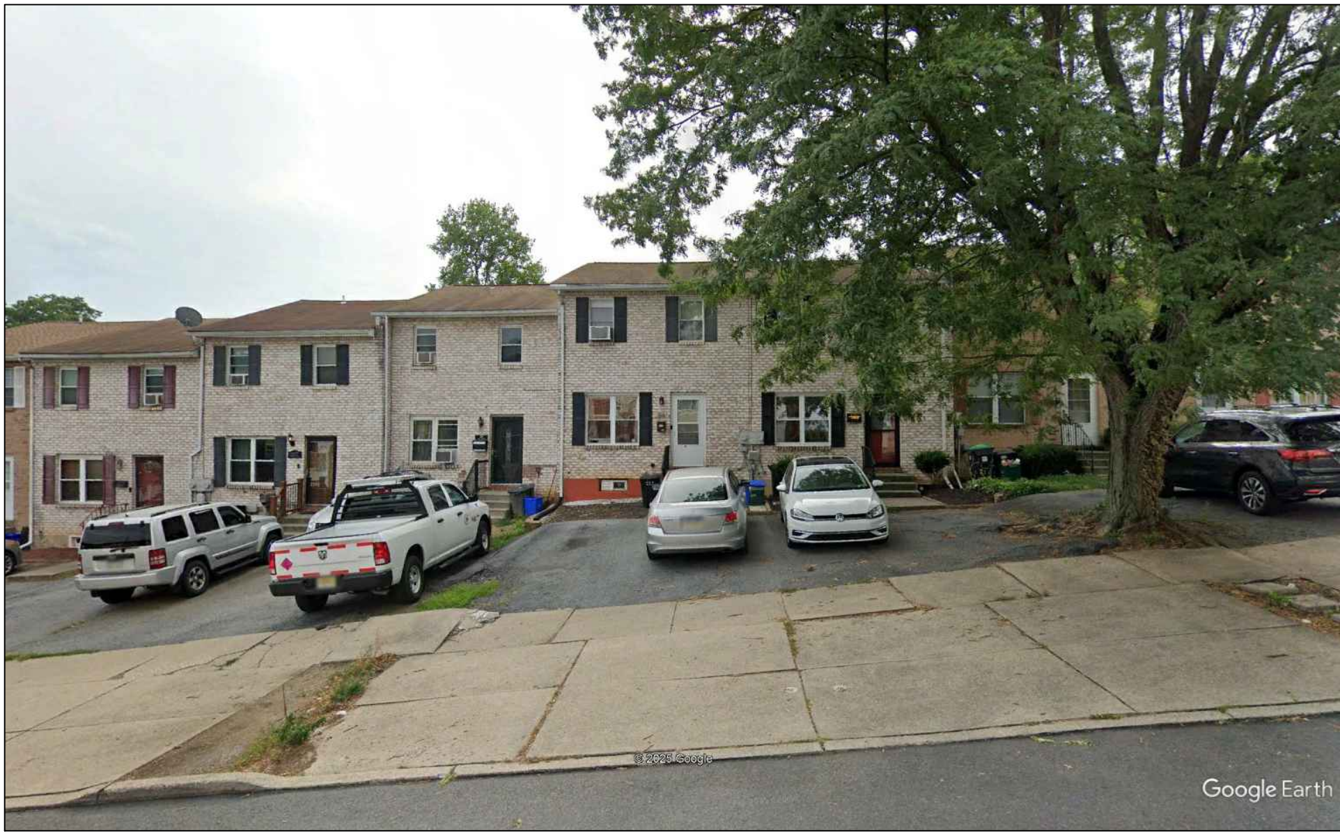
211 TO 227 8th AVENUE (NINE MULTI-FAMILY)