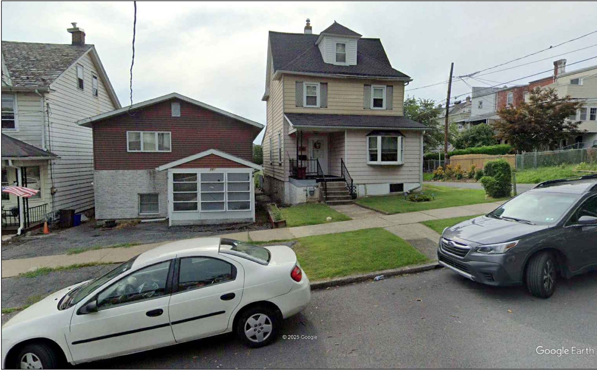
257 & 259 8th AVENUE (TWO SINGLE FAMILY DETACHED)