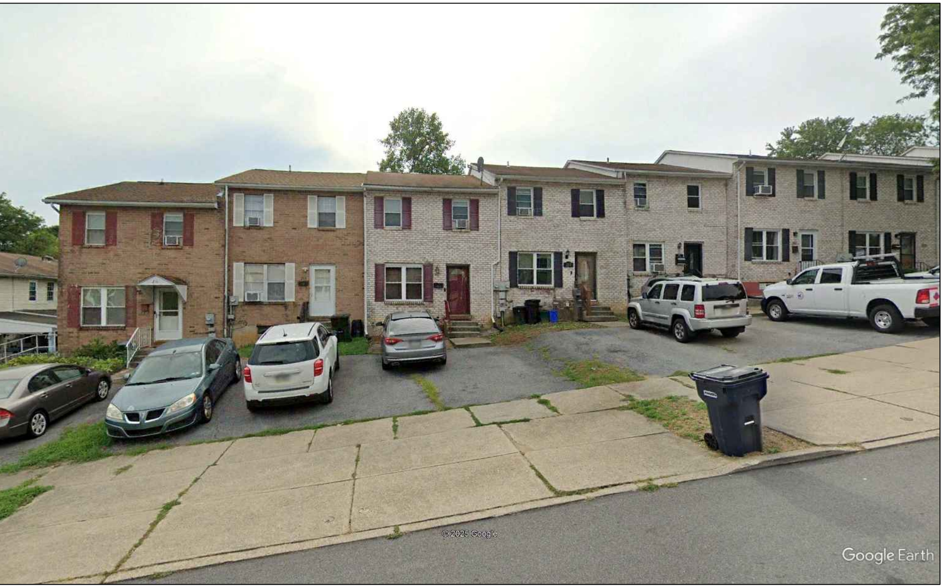
211 TO 227 8th AVENUE (NINE MULTI-FAMILY)

NOTE: IMAGES WERE TAKEN FROM GOOGLE EARTH STREET LEVEL VIEW. DATES OF PHOTOGRAPHY ARE 8/2023 AND 7/2024.