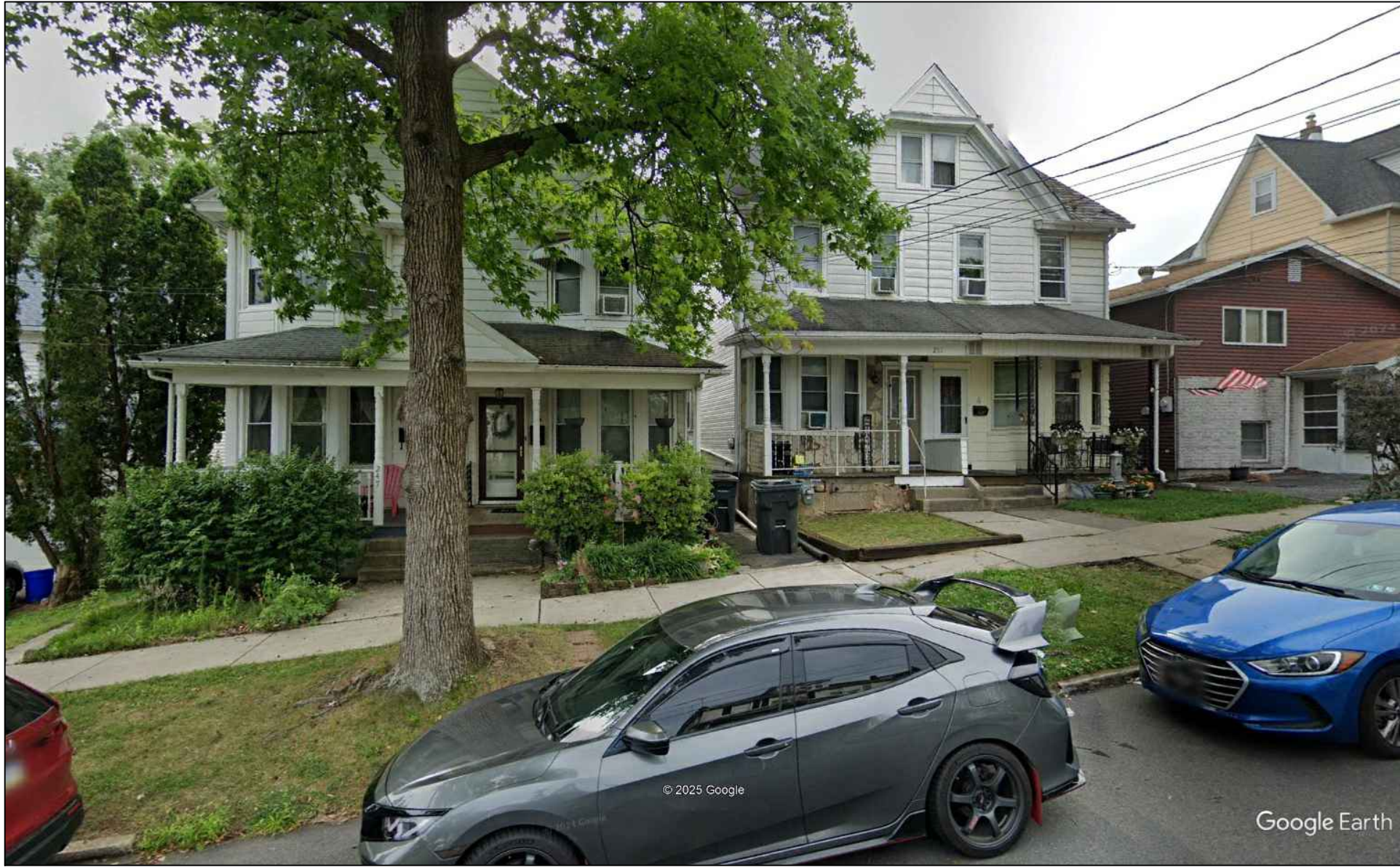
247-253 8th AVENUE (FOUR SINGLE FAMILY SEMI-DETACHED)