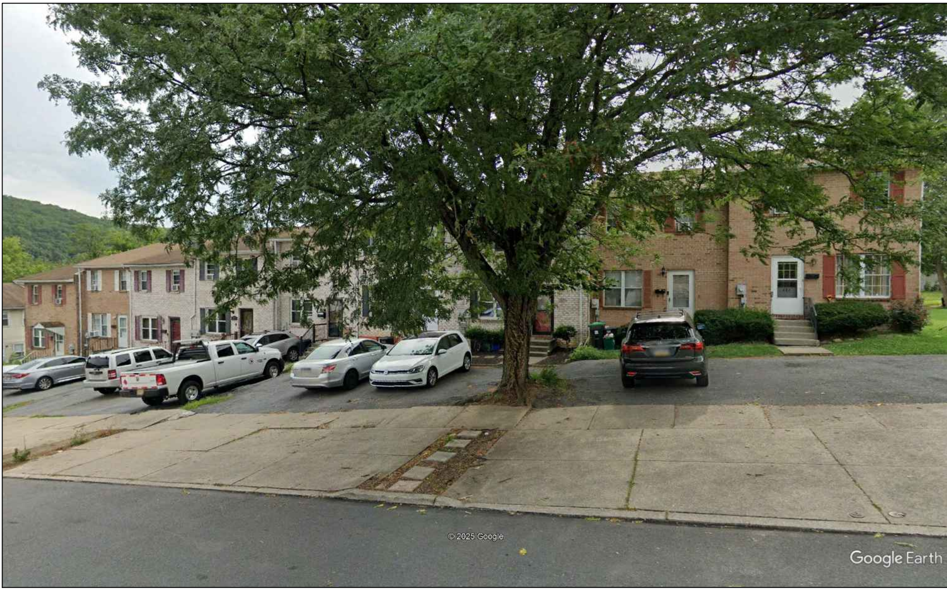
211 TO 227 8th AVENUE (NINE MULTI-FAMILY)