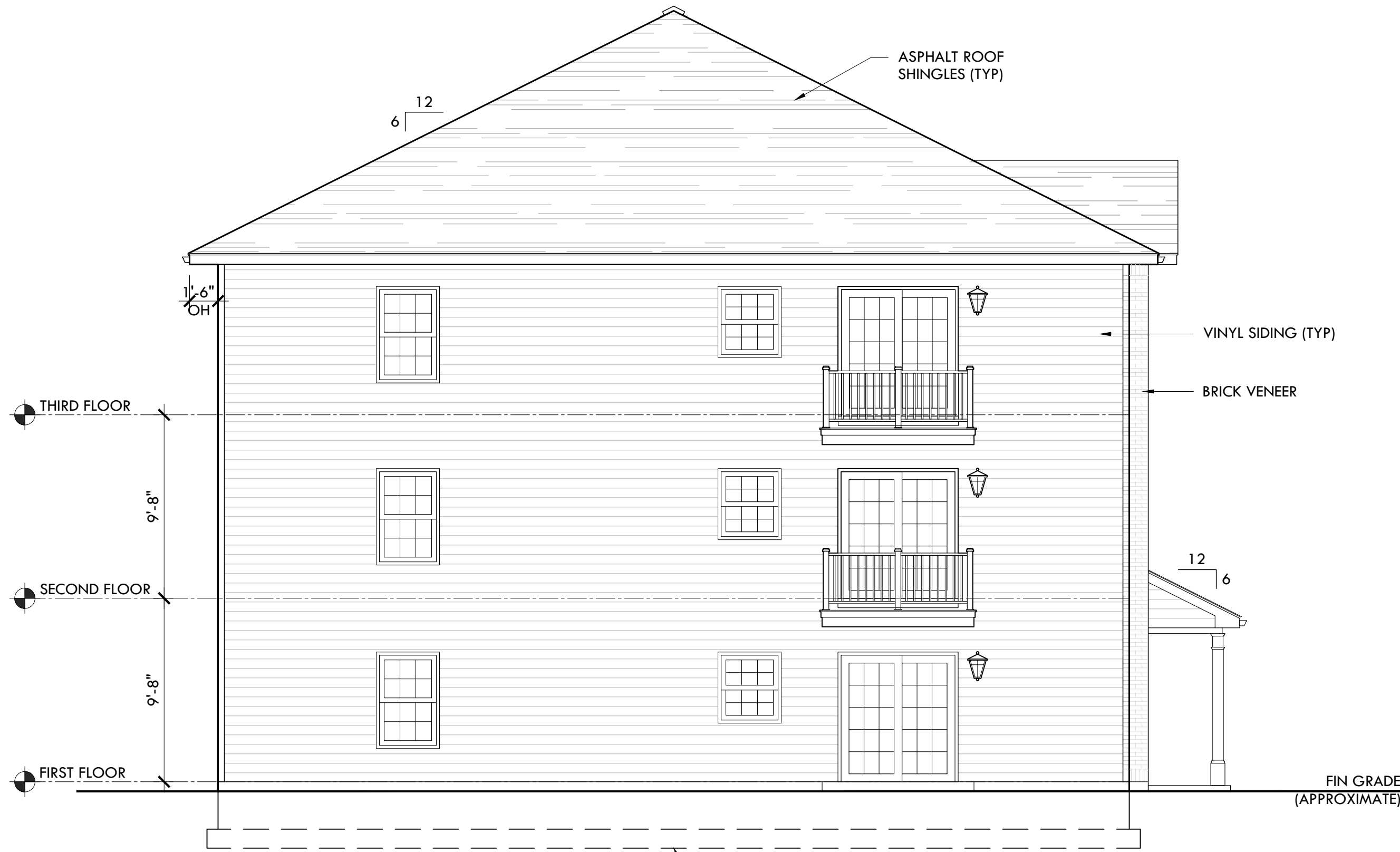
SIDE ELEVATION(S) SCALE - 3/16" = 1'-0"