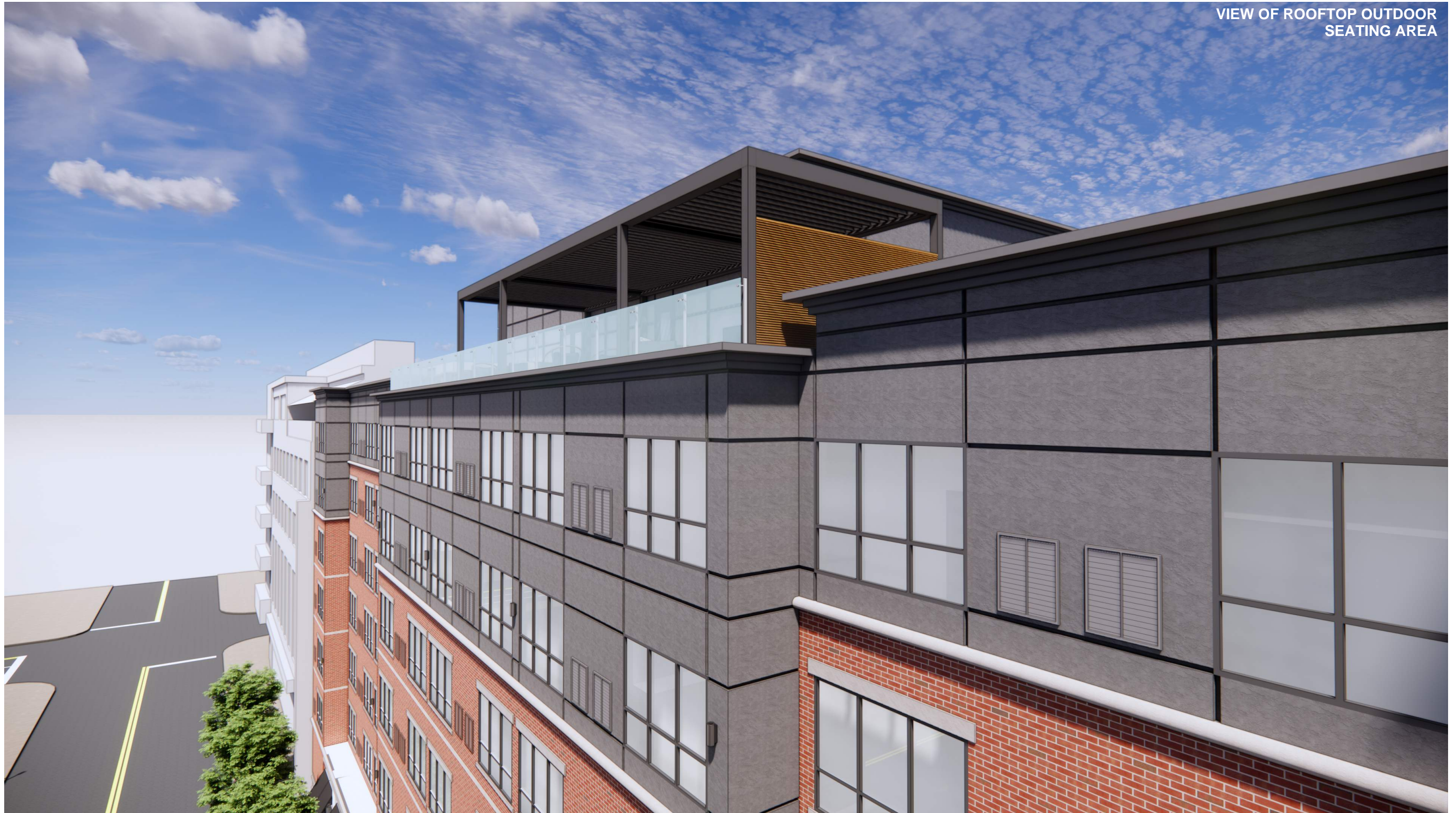
SOUTH BETHLEHEM HOTEL TEMPO BY HILTON 10.03.25