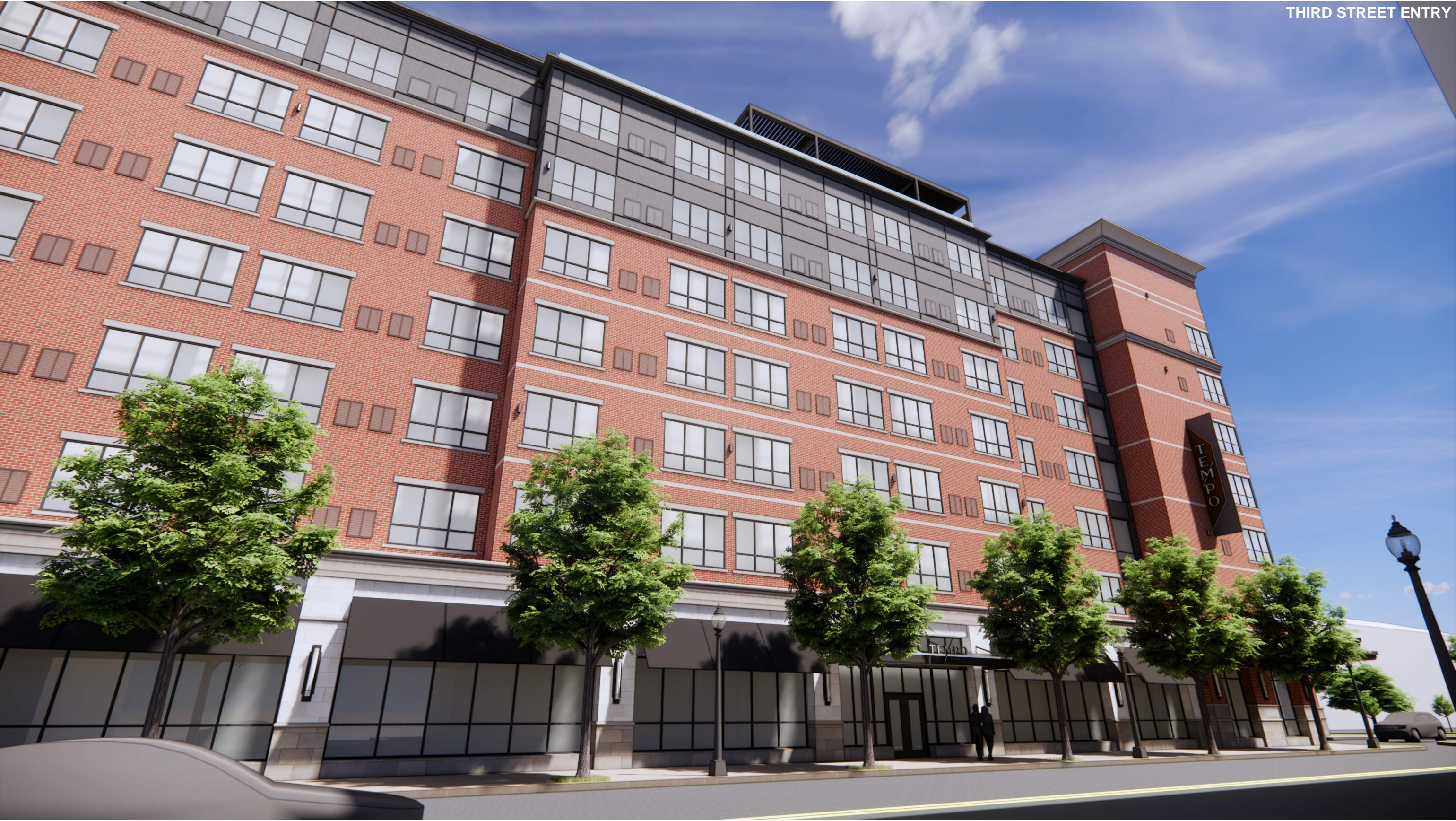
SOUTH BETHLEHEM HOTEL TEMPO BY HILTON 10.03.25