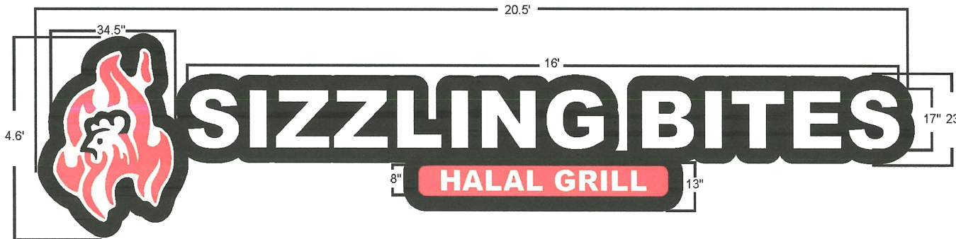
LED CHANNEL LETTER SIGN

ALL LED SIGNS ARE MADE IN UL CERTIFIED MANUFACTURING FACILITY