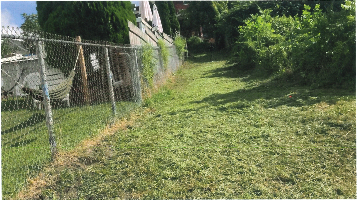
Picture 6. Rear Elevation