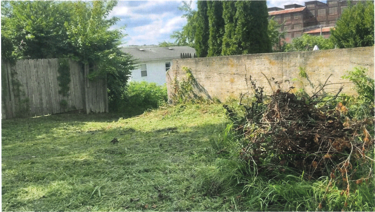
Picture 4. Rear Elevation