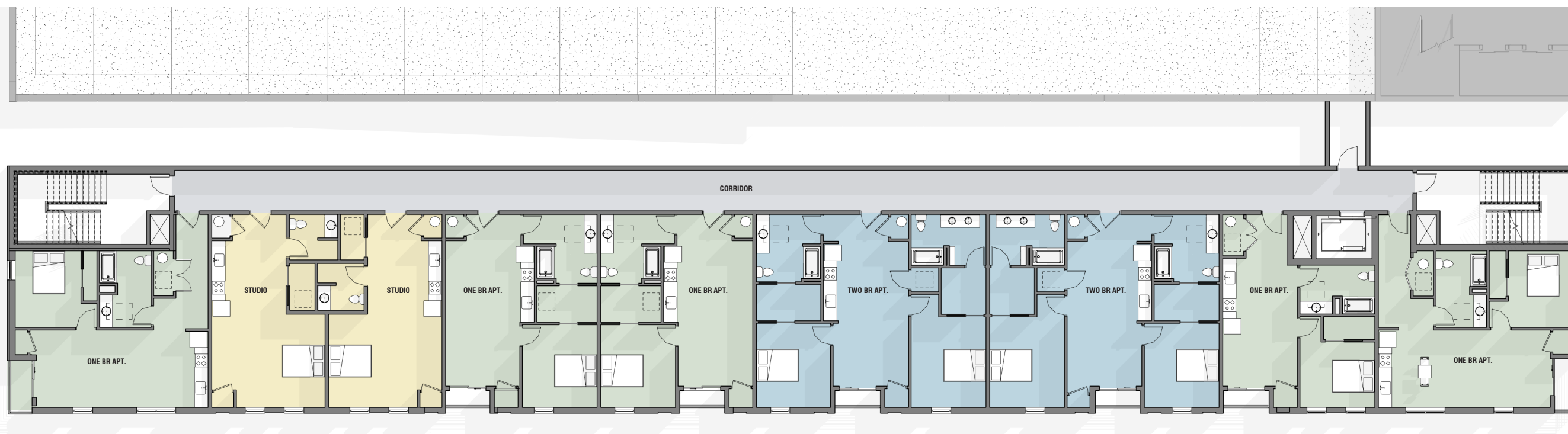
TYP. FLOOR PLAN