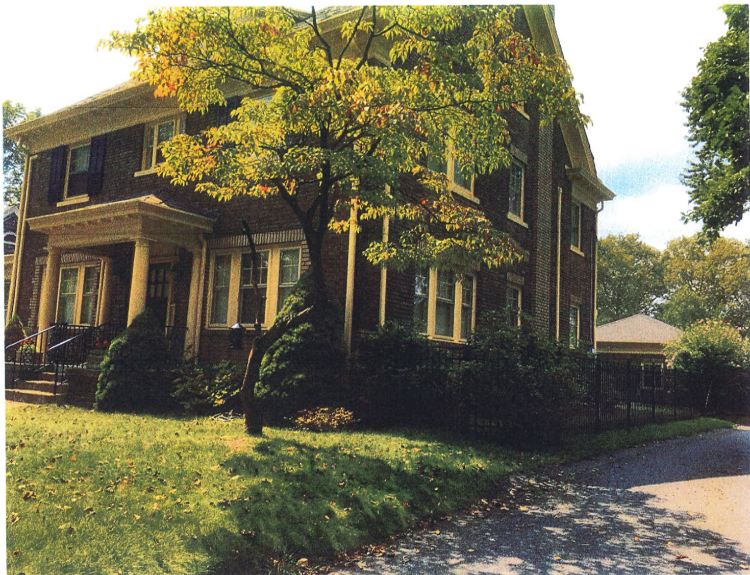
415 High st right side