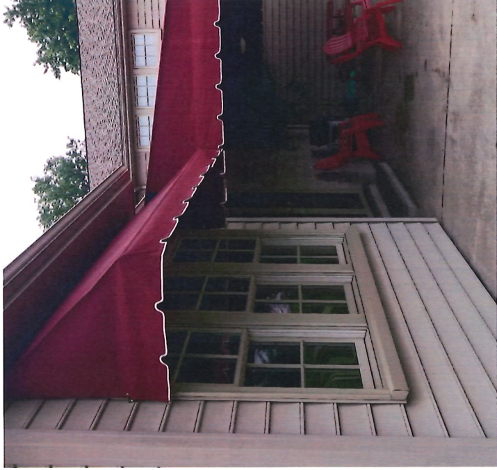
Sample photo of Dubonnet Tweed on Awning