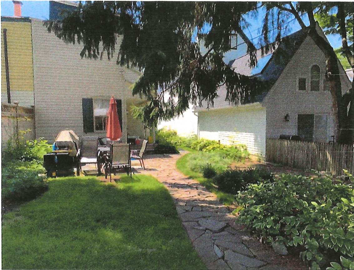
Rear view of home