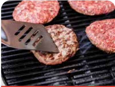
Color is Not a Reliable Indicator of Safety