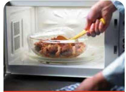
Microwave to Safe Temperatures