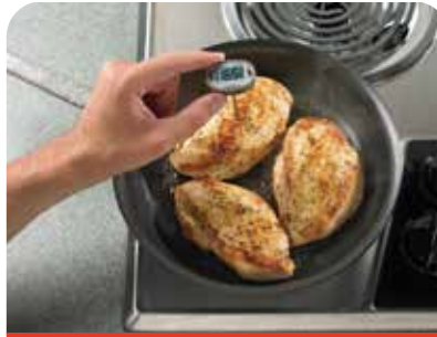
Check with a Food Thermometer