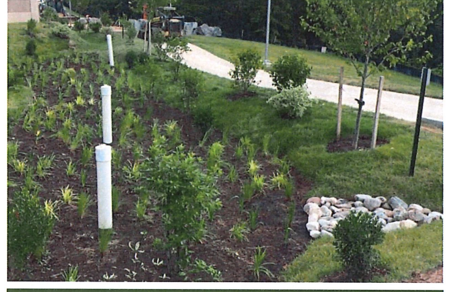
A stormwater structure, such as the bioretention facility above, may qualify a property owner for a credit on the stormwater utility fee.

The City will provide credit to property owners who operate and maintain qualifying stormwater management structures. These private structures help the City by reducing the cost of managing the public system. Typical facilities include dry ponds, wet ponds and wetlands, bioretention, bioswales and filter strips, permeable pavers, and green roofs.