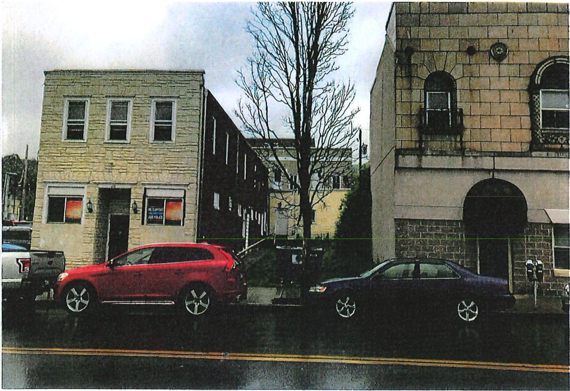
FRONT and Side of 210-212 E. 3rd Street