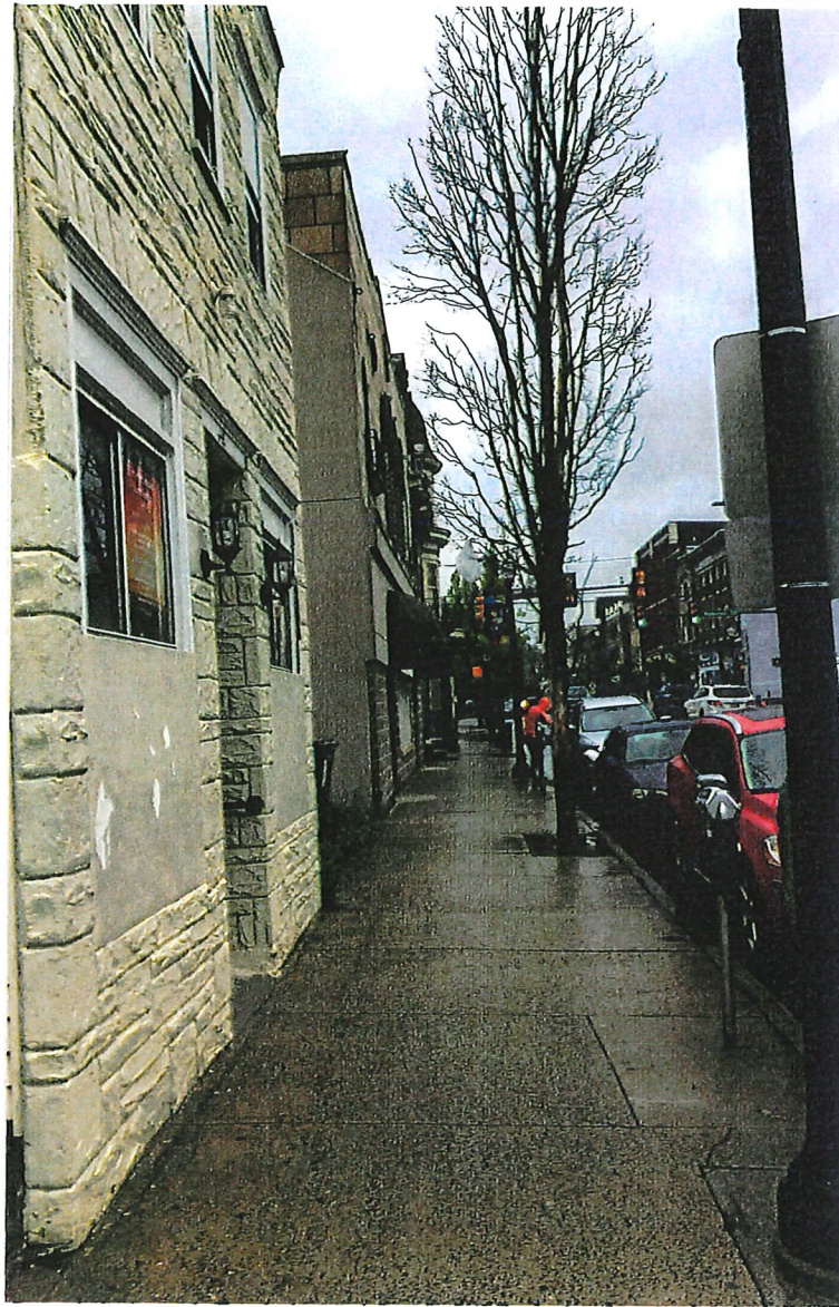
FRONT of 210-212 E 3 rd STREET LOOKING WEST