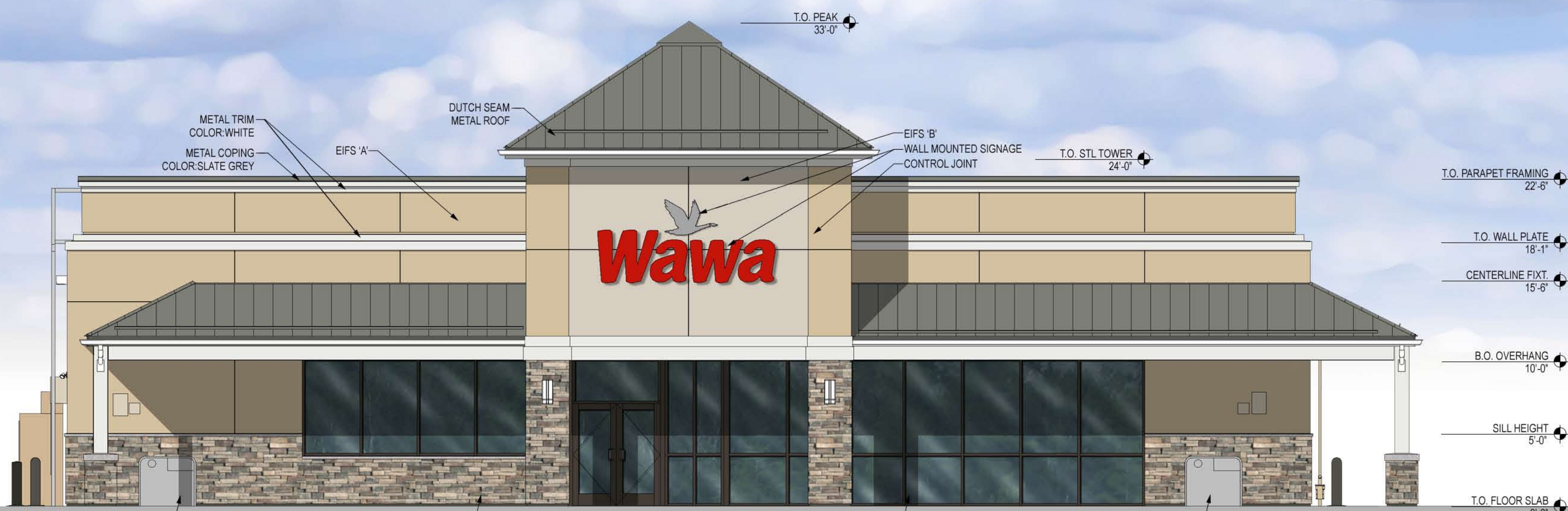
FRONT (NORTH) ELEVATION