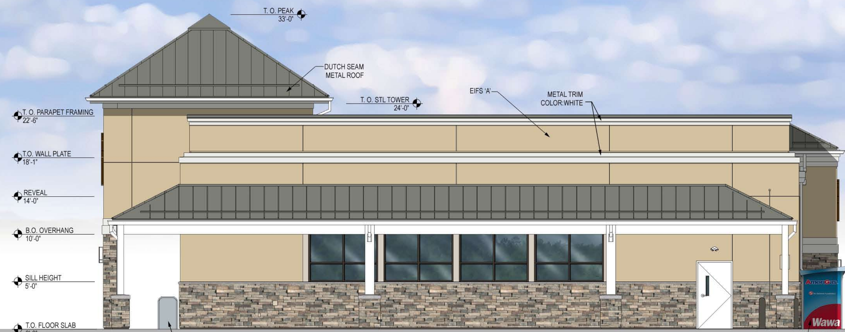
RIGHT (EAST) ELEVATION (HELLERTOWN ROAD)