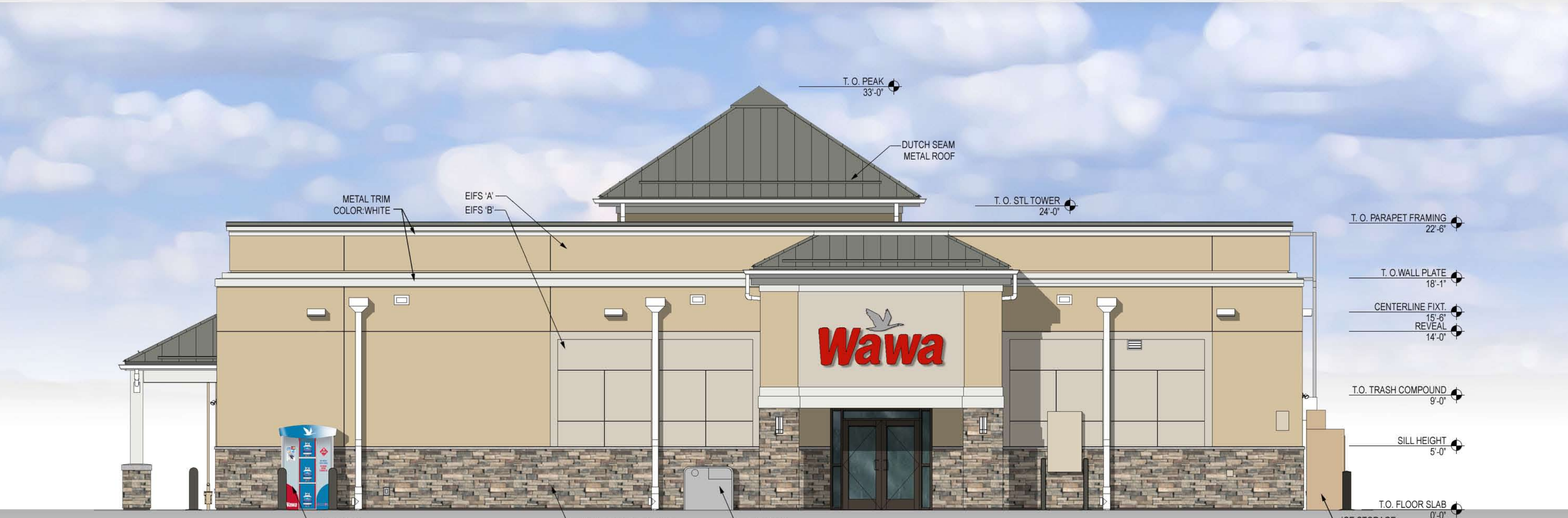
REAR (SOUTH) ELEVATION (MILLSIDE DRIVE)