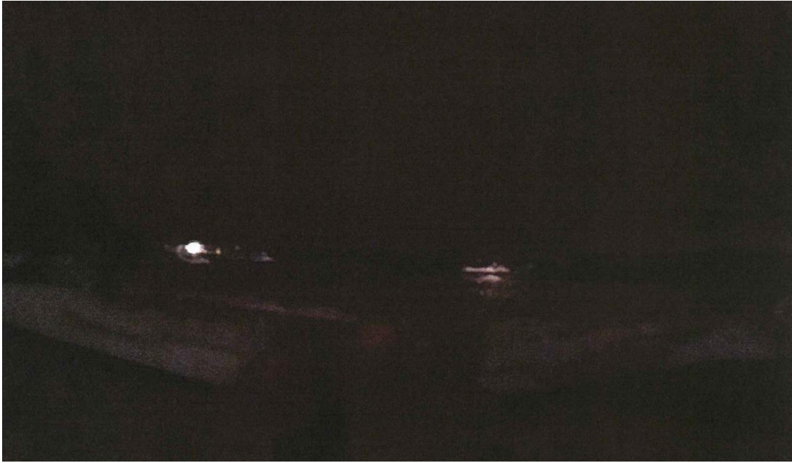
INTERIOR VIEW OF DAYLIGHT PENETRATING THROUGH WALL/FLOOR ABUTMENT