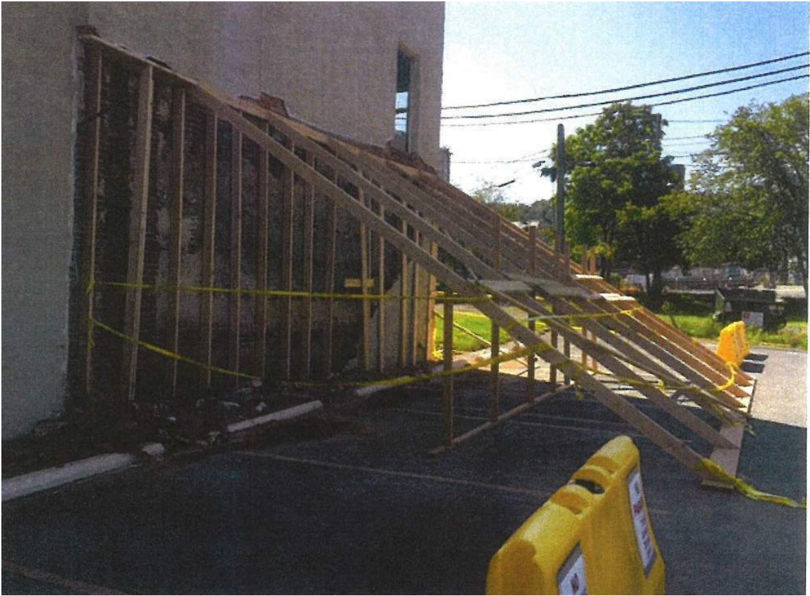
POST FAILURE TEMPORARY WALL BRACING SUPPORT AT WEST WALL