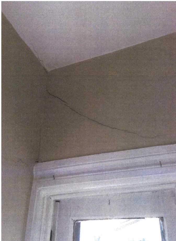
INTERIOR VIEW OF MAJOR WALL AND CEILING DIFFERENTIAL MOVEMENT