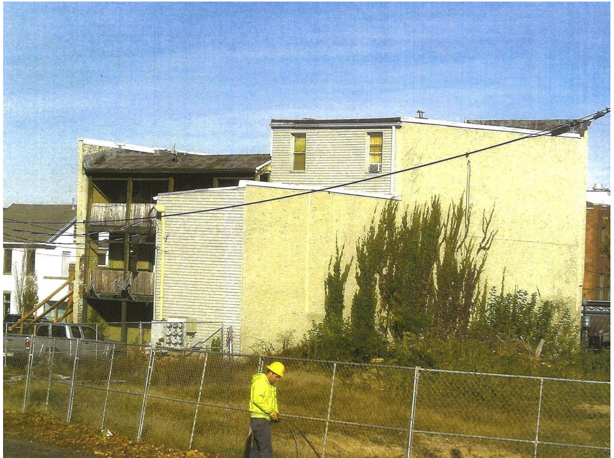
EAST EXTERIOR VIEW