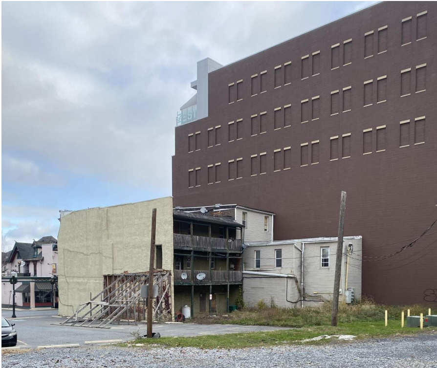
WEST AND WEST EXTERIOR VIEWS