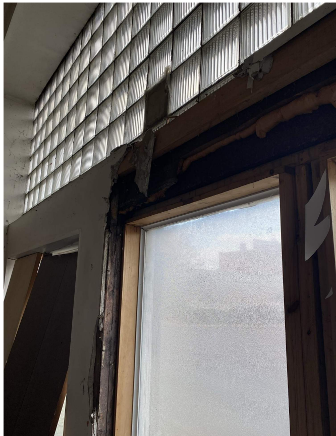
CURRENT INTERIOR CONDITIONS