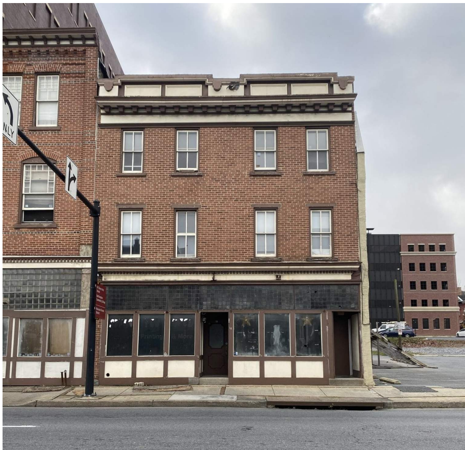
CURRENT CONTEXTUAL NORTH EXTERIOR VIEWS