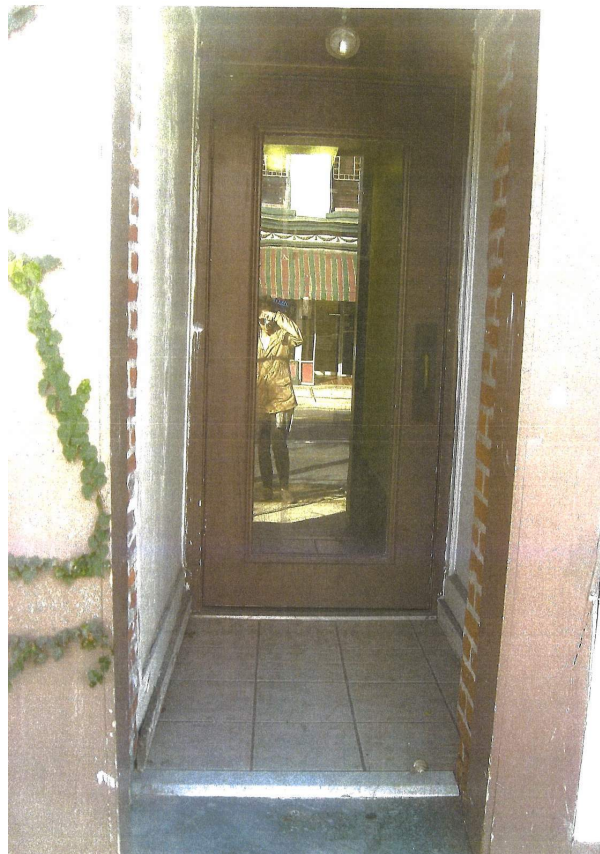
NORTH EXTERIOR VIEW - DOOR TO APARTMENTS