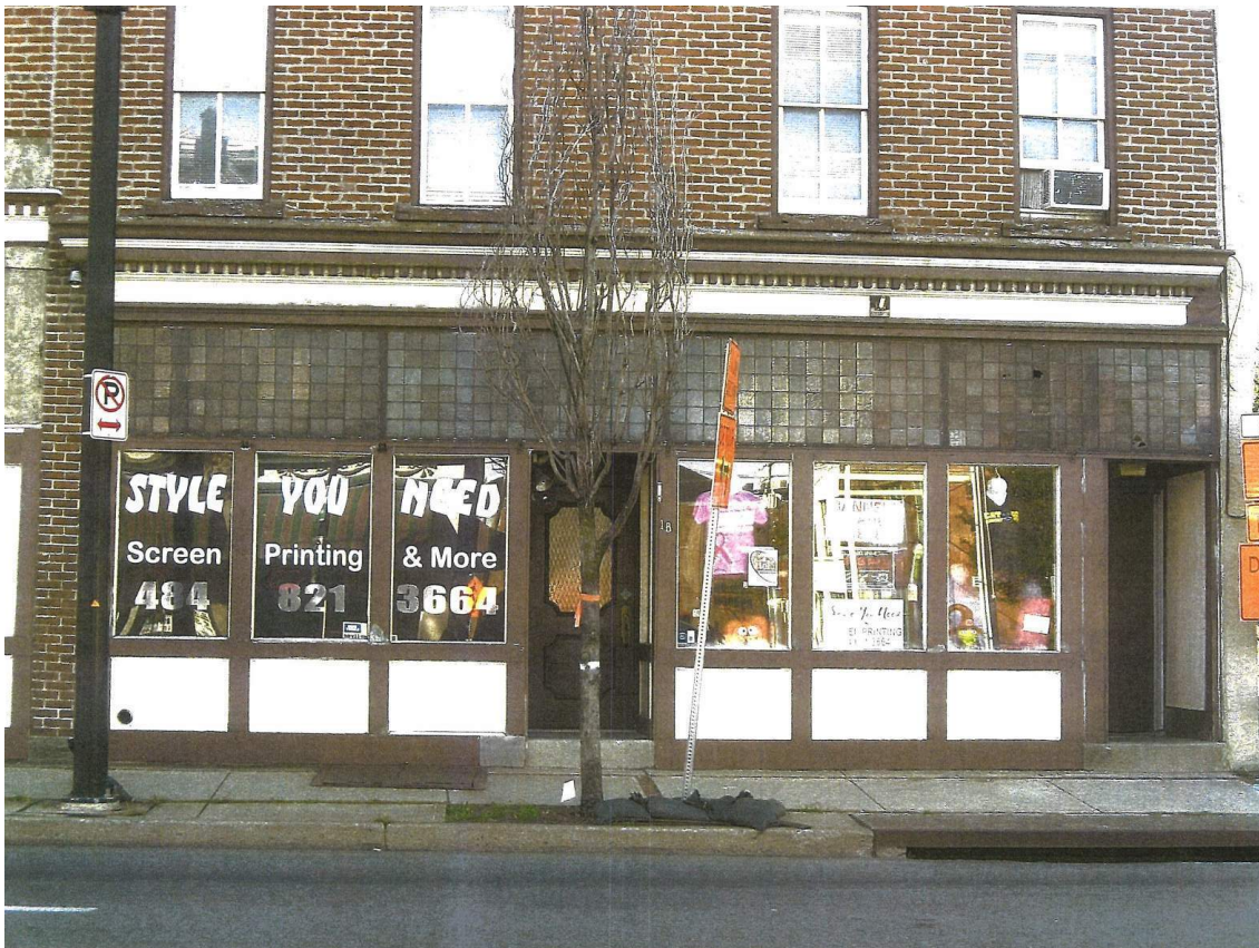
NORTH EXTERIOR VIEW - ENLARGED PARTIAL PICTURE