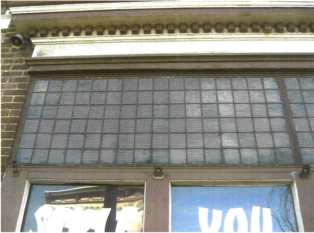
NORTH EXTERIOR VIEW - LEADED GLASS