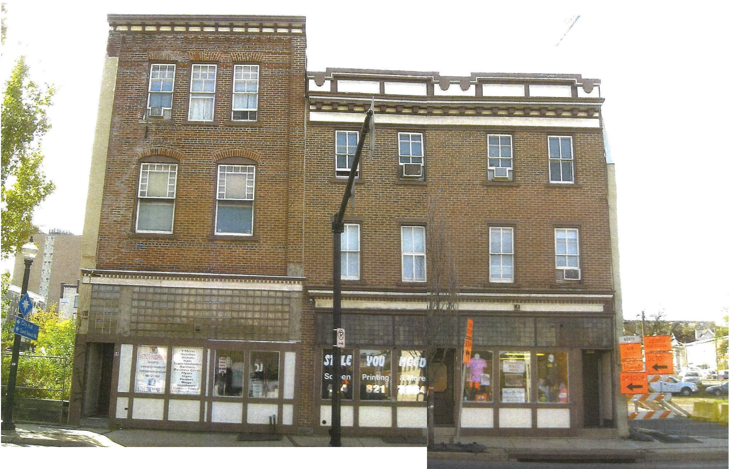
NORTH EXTERIOR VIEW