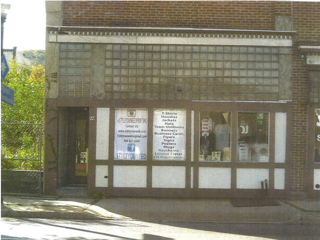
NORTH EXTERIOR VIEW - ENLARGED PARTIAL PICTURE