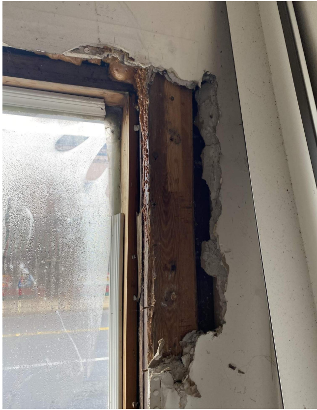
CURRENT INTERIOR CONDITIONS