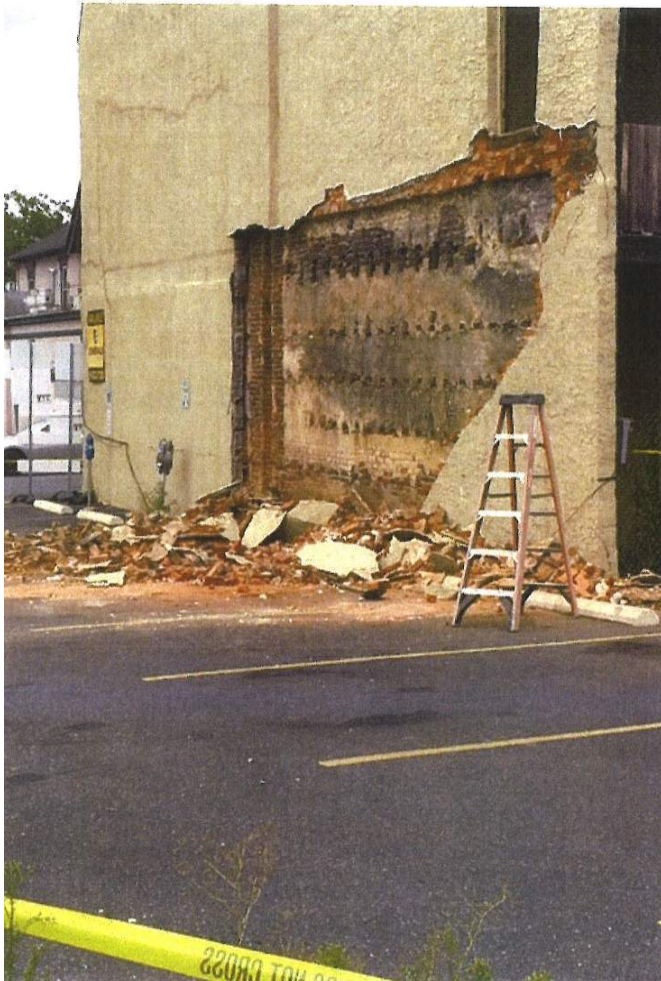
WEST WALL FAILURE