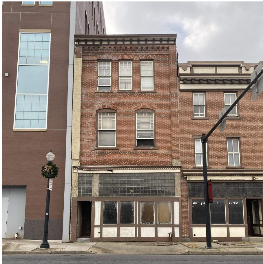
CURRENT CONTEXTUAL NORTH EXTERIOR VIEWS