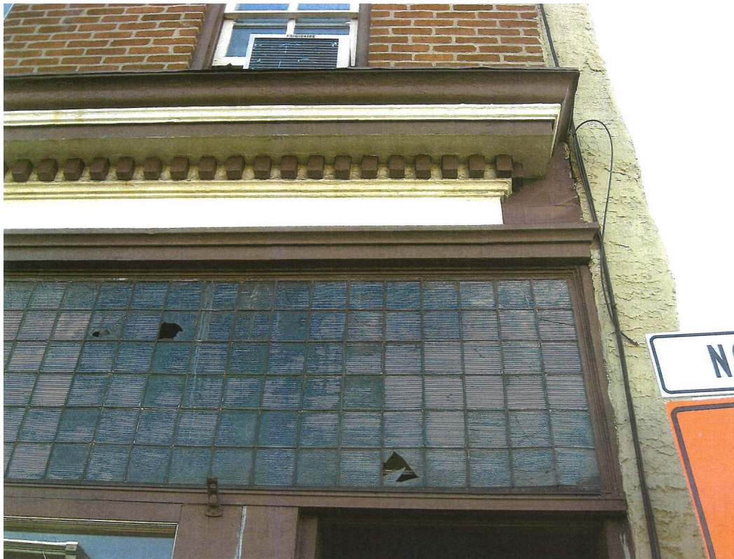
NORTH EXTERIOR VIEW - LEADED GLASS