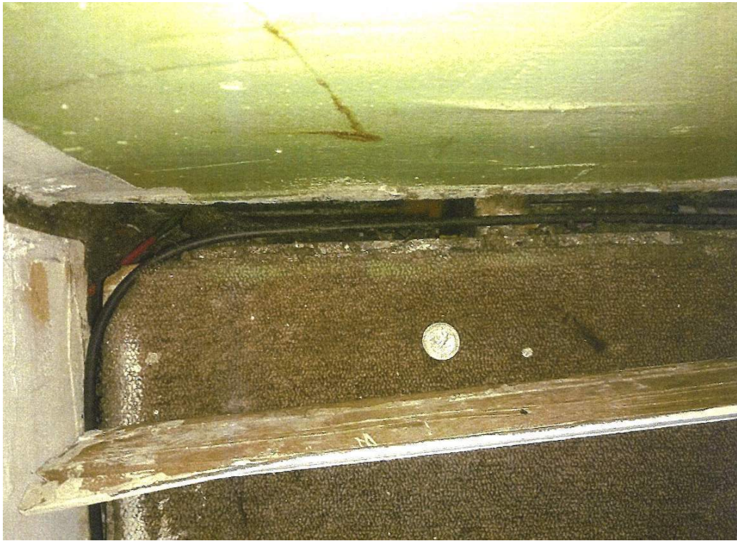
INTERIOR VIEW OF SEPARATION AT WALL/FLOOR ABUTMENT