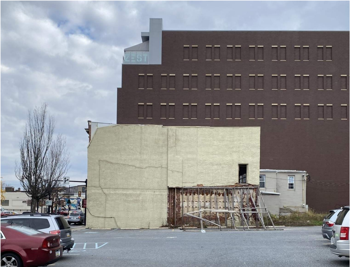
WEST WALL WITH 4 YEAR MIN TEMPORARY WALL BRACING