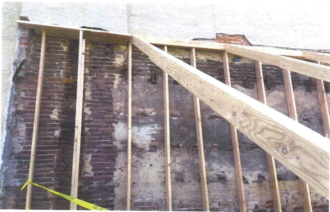
POST FAILURE TEMPORARY WALL BRACING SUPPORT AT WEST WALL