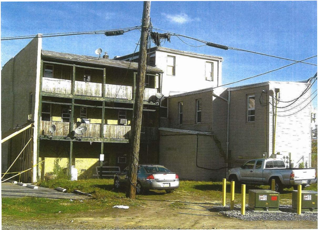
SOUTH EXTERIOR VIEW