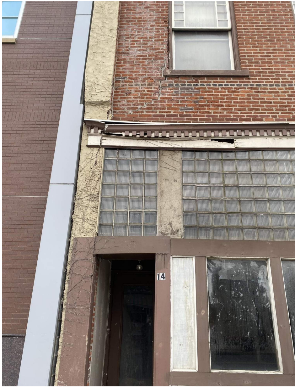
CURRENT CONTEXTUAL NORTH EXTERIOR VIEWS