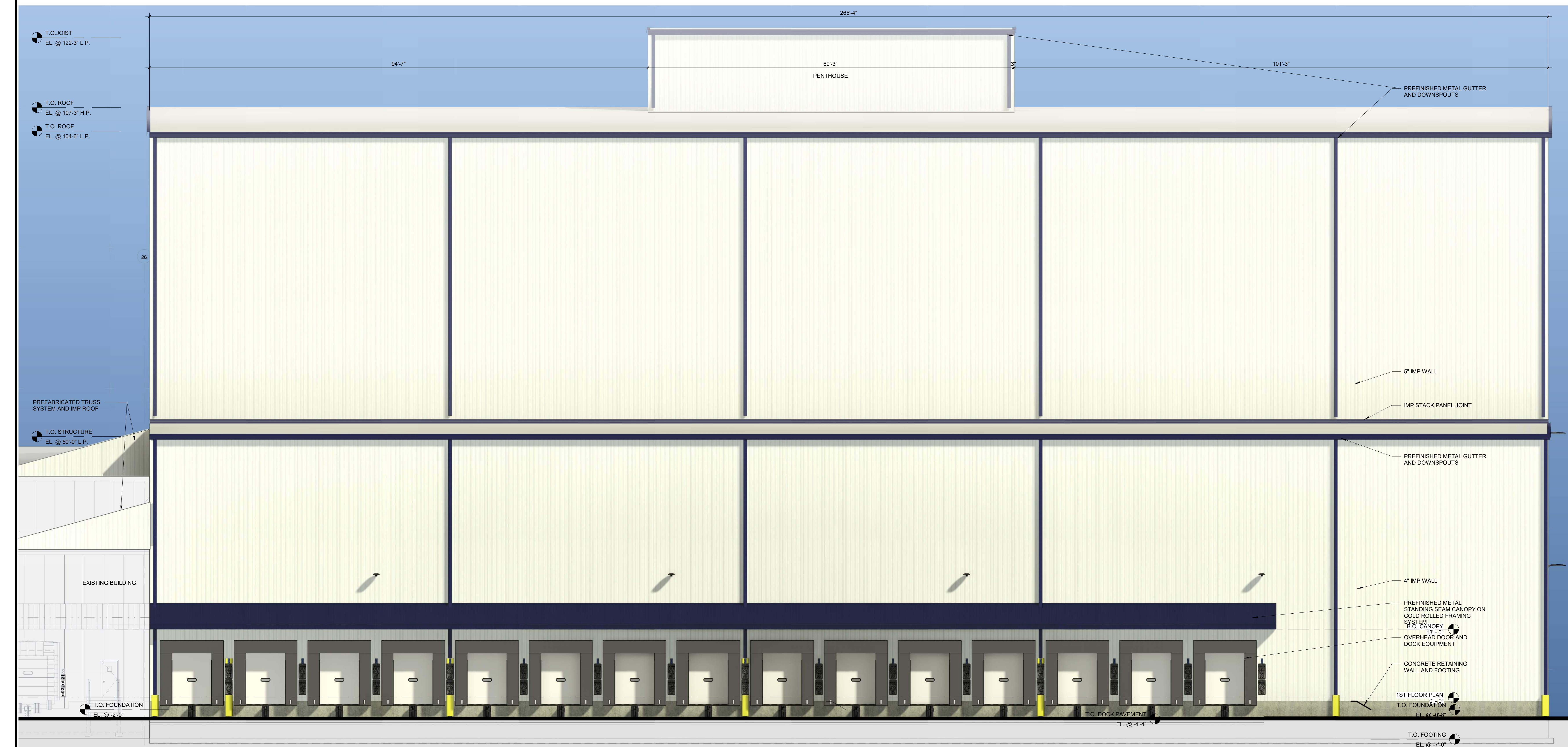
2 SOUTH BUILDING ELEVATION A3.00 1/8" = 1'-0"