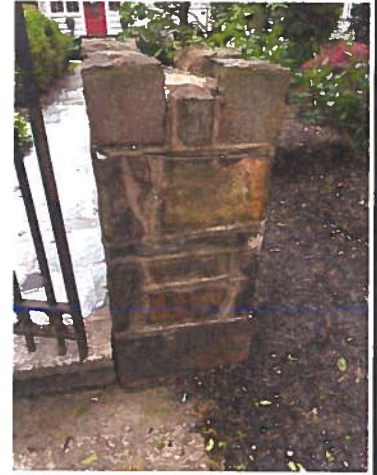
Picture of stone to be used on step risers