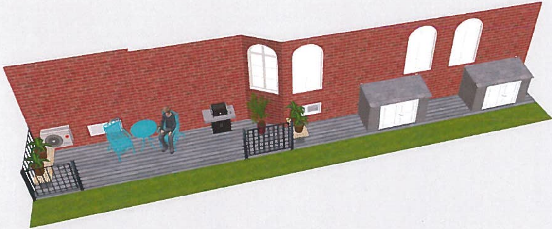
Patio will sit anywhere from 6"-12" off ground level depending on slope of existing ground.