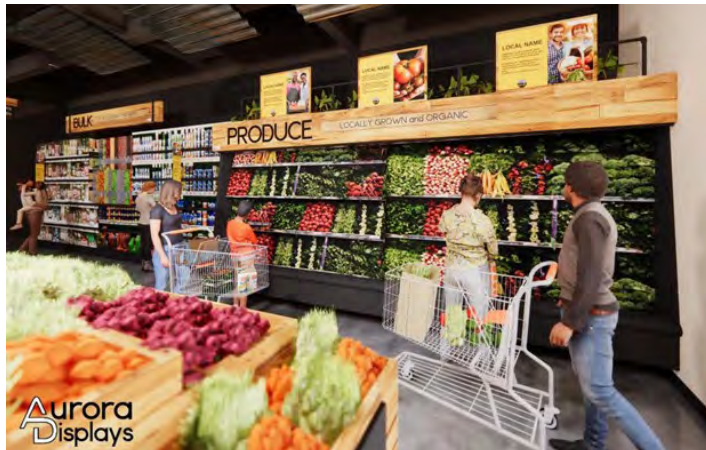
Pictured: An artist's conception of the interior of the Bethlehem Food Co-Op, a community-owned, 'everyone welcome' market coming to 250 E. Broad St.

The board leads an extensive group of volunteers but has also assembled a team of professionals with expertise in food co-op project management, store design, and store décor. They are working on creating a space for the co-op's store on the ground floor of a four-story, mixed-use building being constructed on the site. Peron Development and Boyle Construction are driving the project.