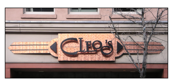
The copper background provides a unique frame for the mounted letters of the business' name and compliments the horizontal orientation of the frieze. The distinctive lettering both identifies the business and serves as its logo.