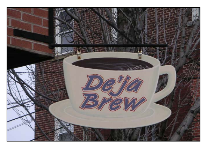
Signs for businesses located at corners can pose particular challenges. At this location, the sign is projected out from the corner and is visible from both streets. The coffee cup shape reinforces the business identity.

The Banana Factory employs a painted wall sign to convey its message, a technique that has been used historically for signage.