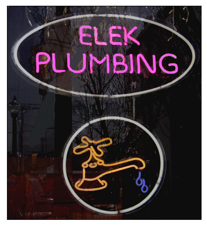
Neon has been used for signage since the 1920s and fits into the South Bethlehem Historic Conservation District's period of significance of 1900 through 1950. This neon sign has been customized for the business and clearly identifies the type of available merchandise.