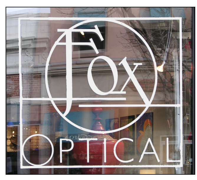
This etched window signage uses custom lettering and a distinctive logo to identify the type of business.