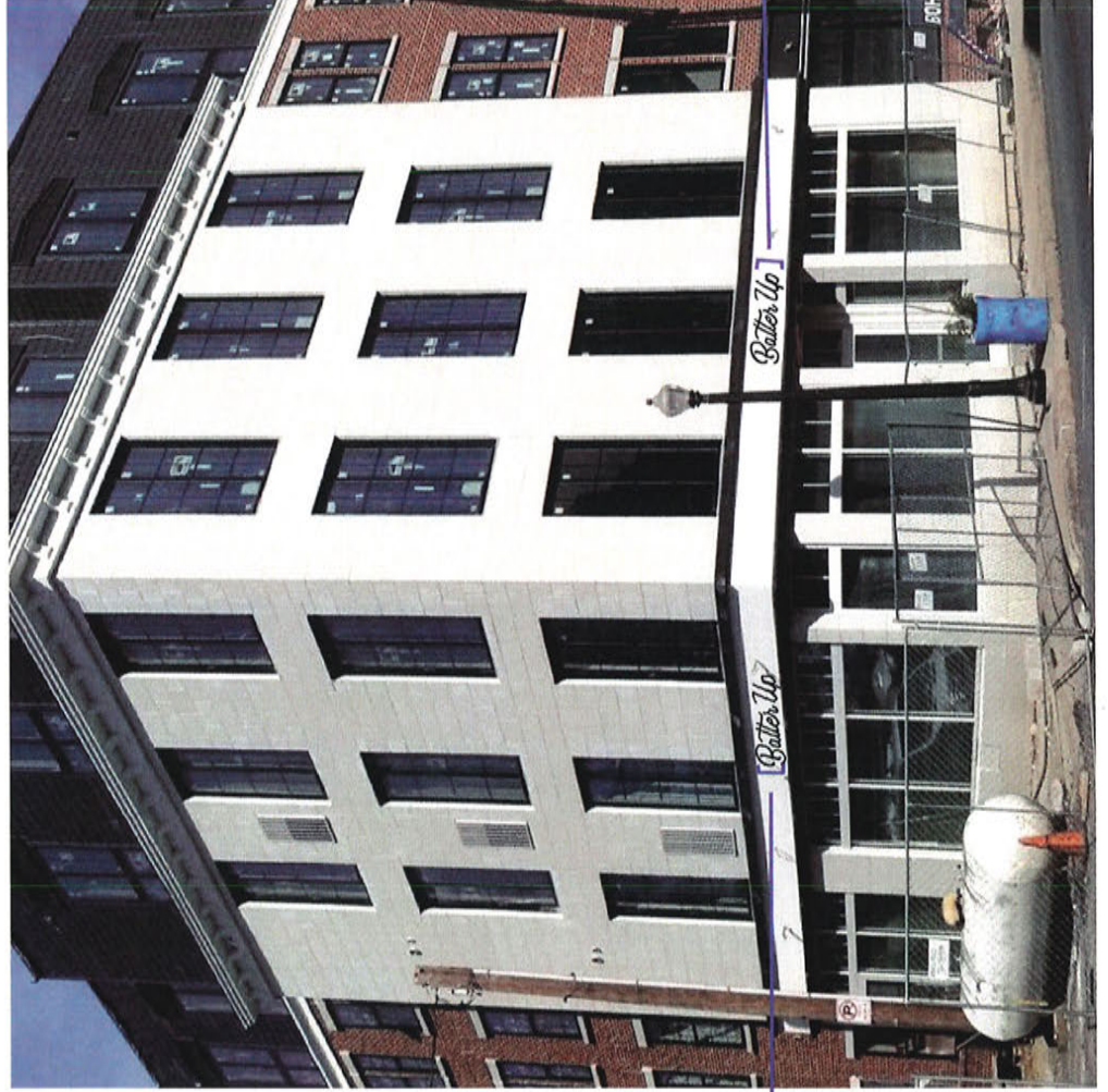
MAIN SIGNAGE MOCKUP

Measurement: 20" Height 58.66" Wide Placement: a. Middle of side facade b. Right aligned between hooks