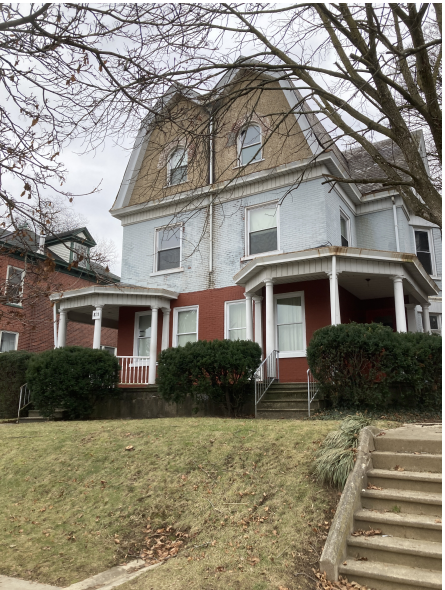
817 - 821- 823 West Broad Street - Existing Conditions